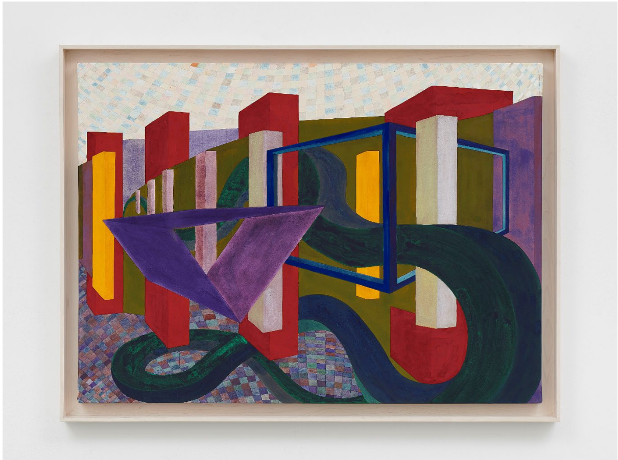
Al Held Particular Paradox #18 2000

Al Held White Cube Paris 19 April – 27 May 2023