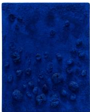
Yves Klein Relief éponge bleu (Kleine Nachtmusik) 1960 Sponge, stone and pigments on wood and canvas 145 x 116 cm Städel Museum, Frankfurt am Main © The Estate of Yves Klein / VG Bild-Kunst, Bonn 2022