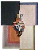
Oskar Schlemmer Ornamental Sculpture on Divided Frame 1919/23 wood, painted and brazed, oil on chalk ground 90 × 68 × 4.2 cm (frame), 47.8 × 20.2 × 11 cm (centrepiece, linden) Kunstsammlung Nordrhein-Westfalen, Düsseldorf