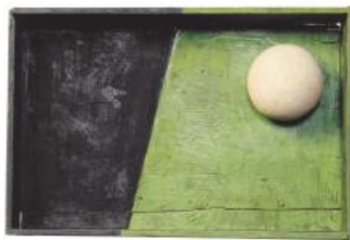
Ivan Puni The White Sphere (La Boule blanche) 1915 Wood and metal, painted 34 × 51 × 12 cm Centre Pompidou, Paris bpk/Centre Pompidou, Paris/CNAC-MNAM/Adam Rzepka © VG Bild-Kunst, Bonn 2023