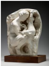
Auguste Rodin Young Mother in the Grotto (Jeune mère à la grotte) 1885 Plaster 36,3 x 26,8 x 24 cm Musée Rodin, Paris