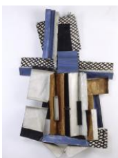
Pablo Picasso Violin (Violon) 1915 Painted sheet metal and iron wire 100 × 63,7 × 18 cm Musée national Picasso, Paris