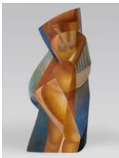
Alexander Archipenko Bather (Baigneuse) 1915 wire, papier-mâché and plaster 47.5 × 23 × 18.5 cm Städel Museum, Frankfurt am Main, property of Städtischer Museums-Verein e.V. © VG Bild-Kunst, Bonn 2023, photo: U. Edelmann