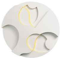
Sophie Taeuber-Arp Shells and Flowers (Coquilles et fleurs) 1938 oil on wood 60 × 60 × 7,7 cm Aargauer Kunsthaus Aarau und Gottfried Keller-Stiftung, Bundesamt für Kultur, Bern