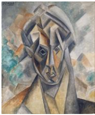
Pablo Picasso Portrait of Fernande Olivier (Portrait de Fernande Olivier) 1909 oil on canvas 65 × 54.5 cm Städel Museum, Frankfurt am Main, property of Städtelscher Museums-Verein e.V.