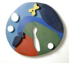
Jean Arp Tower Clock (Horloge) 1924 wood, painted 53.5 × 53 × 6 cm Kunstmuseum Basel, gift from Marguerite Arp-Hagenbach, 1968 © VG Bild-Kunst, Bonn 2023