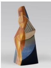
Alexander Archipenko Bather (Baigneuse) 1915 wire, papier-mâché and plaster 47.5 × 23 × 18.5 cm Städel Museum, Frankfurt am Main, property of Städtischer Museums-Verein e.V. © VG Bild-Kunst, Bonn 2023, photo: U. Edelmann