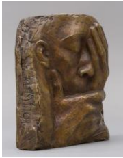
Käthe Kollwitz Lament 1938-1941, cast 1960 at the latest Bronze 27.3 × 26.2 × 9.8 cm Städel Museum, Frankfurt am Main