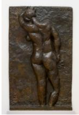
Henri Matisse Back I (Nu de dos I) 1909 Bronze 188 x 114 x 16,5 cm Hamburger Kunsthalle

To be reprinted only in connection with a press coverage about the exhibition or the Städel Museum.