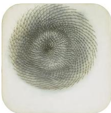
Günther Uecker Organic Structure 1962 nails and oil on canvas on wood 110 x 110 x 8 cm Städel Museum, Frankfurt am Main © VG Bild-Kunst, Bonn 2023