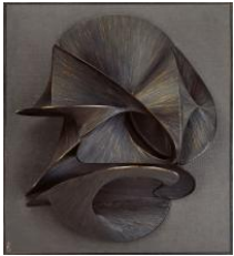
Antoine Pevsner Dynamic Construction (Construction dynamique) 1947 brass on fibreboard, painted 95 × 87 × 38 cm Centre Pompidou, Paris Photo: bpk/Centre Pompidou, Paris/CNAC-MNAM/Adam Rzepka © VG Bild-Kunst, Bonn 2023