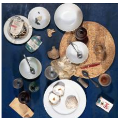
Daniel Spoerri Restaurant Spoerri 1968 various objects, glass, metal, paper, ceramic, wood, ash, pencil, acrylic glass 76 x 76 x 18 cm