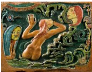
Paul Gauguin Be Mysterious (Soyez mystérieuses) 1890 Lime wood, polychrome, traces of dark pencil 73 x 95 x 5 cm Musée d'Orsay, Paris