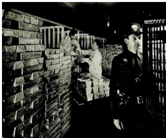
Silver bars in the Kodak vault, 1945