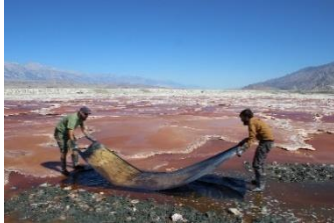
© Optics Division of the Metabolic Studio (Lauren Bon, Tristan Duke and Richard Nielsen), Lake Bed Developing Process , 2013

The press images in this pack are free of rights for the duration of the exhibition. They may not be cropped, modified or retouched. All reproductions, except for exhibition views, must be accompanied by the full captions and copyrights shown below.