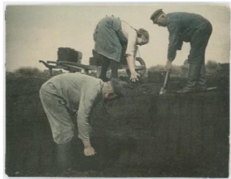
Peat extraction on Hartshoper Moor, ca. 1930