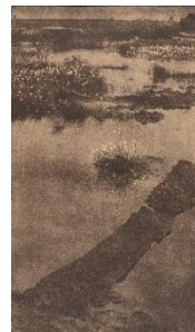
Theodor et Oscar Hofmeister, Moorland Flowers , 1897, Museum für Kunst und Gewerbe Hamburg.