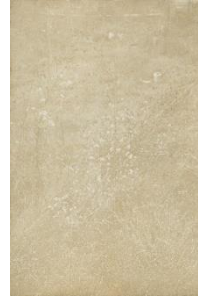
© Susanne Kriemann, Falsche Kamille (False chamomile) from the series Pechblende/Gessenwiese , 2017–2020, Museum für Kunst und Gewerbe, Hamburg