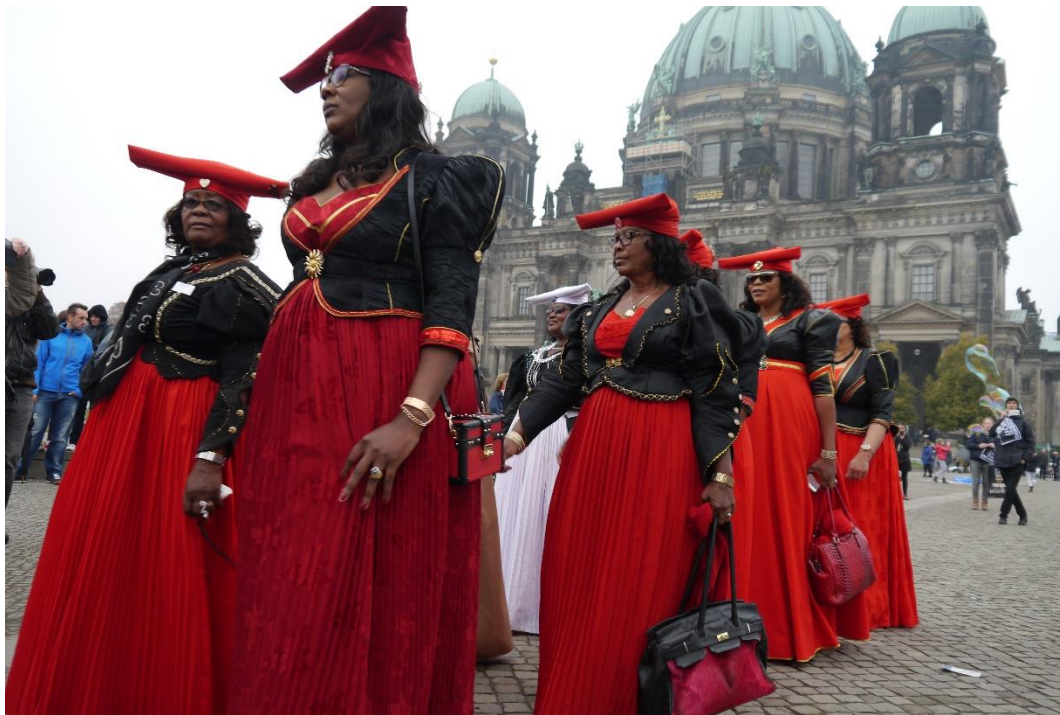
OvaHerero and Nama activists have protested several times in Germany for reparations.