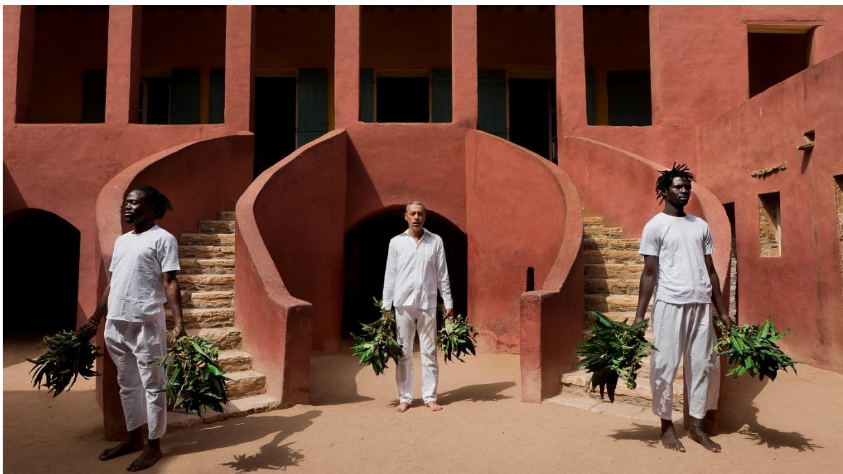
Ayrson Heráclito, O Sacudimentos O Sacudimento da Maison des Esclaves em Gorée, Diptych, 2015 © Ayrson Heráclito