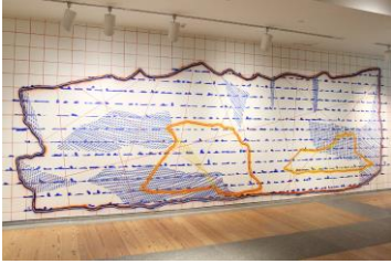
*Peter Soriano (United States (born Philippines), born 1959), Ilulissat, Disko Bugt , 2021. Graphite, spray paint and acrylic paint, 10 x 28 feet. © Peter Soriano.