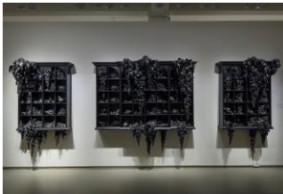
*Lauren Fensterstock (United States, born 1975), The Order of Things , 2016, mixed media with shells, overall: 78 x 240 x 26 inches. Courtesy of the artist and Claire Oliver Gallery, NY. © Lauren Fensterstock