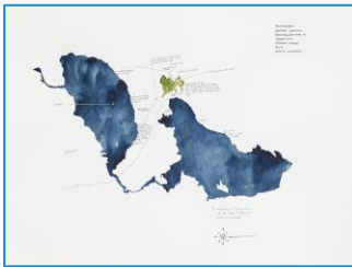
Katarina Pirak Sikku (Sápmi, born 1965), Katarina Pirak Sikku vuorkkás: Birága ja Klementssone johtolagat ja máddariid boazomearkkat / From Katarina Pirak Sikku's archive: Pirak's and Klementsson's hiking trails and ancestral reindeer marks , 2021, ink and watercolor on paper, 57 x 76 inches. Courtesy of the artist. © Katarina Pirak Sikku. Photograph by Piera Niilá Stålka