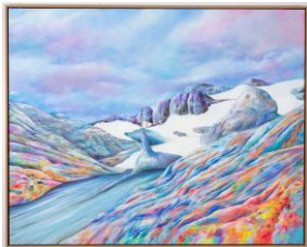
Arngunnur Ýr (Iceland, born 1962), Skaftafell–Pia I , 2021, oil on birch panel, 48 x 60 inches. Courtesy of the artist. © Arngunnur Ýr. Photograph by Bára Kristinsdóttir