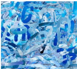
*Justin Levesque (United States, born 1986), Geographical Problems (your files are too powerful) , 2021 (detail), phototex, vinyl, photographs, acrylic, PLA, LCD, and MDF, 175 x 120 x 36 inches.