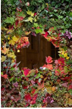
*Christopher Carroll (United States, born 1981), Studio Floor with Mirrors from the portfolio Viridis Genii , 2019, archival pigment print on dibond, 53 x 35 inches.