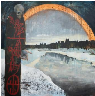
Anders Sunna (Sápmi, born 1985) Torne STYX , 2021, paint and collage on wood, 48 x 88 13/64 x 53/32 inches.