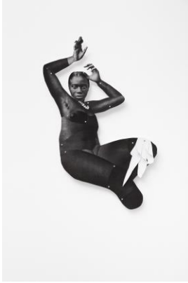
Frida Orupabo (Norway, born 1986), Untitled , 2019, collage with paper pins mounted on aluminum (exhibition copy), 35 10/16 x 22 6/16 inches.