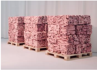
SUPERFLEX (Denmark, established 1993), Vertical Migration , 2019, slip colored ceramic on ash wood pallets, 126 x 47 1/4 x 50 inches. Courtesy of the artists. Vertical Migration is based on the research project Deep Sea Minding , commissioned by TBA21-Academy, as a continuation of their program The Current . Installation view: maat – Museum of Art, Architecture and Technology (Lisbon), 2021. © Courtesy of EDP Foundation. Photography by Francisco Nogueira