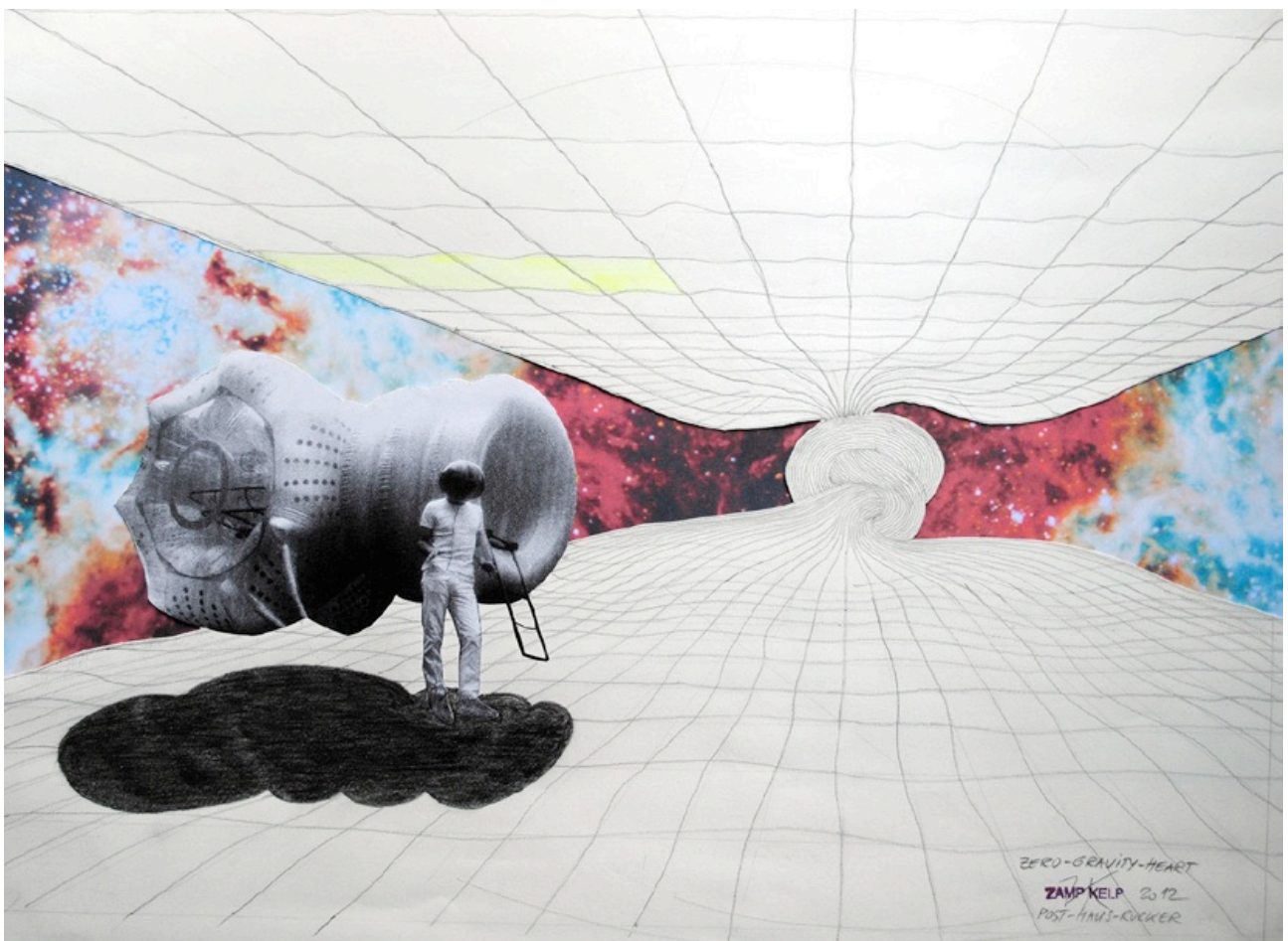
Günter Zamp Kelp, Yellow Heart / Zero Gravity Heart , 2012 Lentos Kunstmuseum Linz

Publication is permitted exclusively in the context of announcements and reviews related to the exhibition. Please avoid any cropping of the images. Thank you for crediting the photographs according to the enclosed indications.