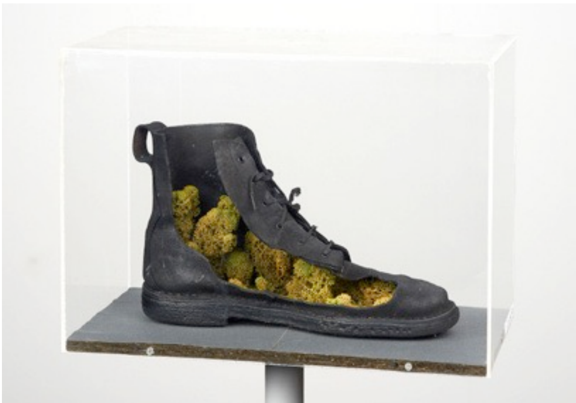
Haus-Rucker-Co (Laurids Ortner), Piece of nature for your foot , 1972 Lentos Kunstmuseum Linz