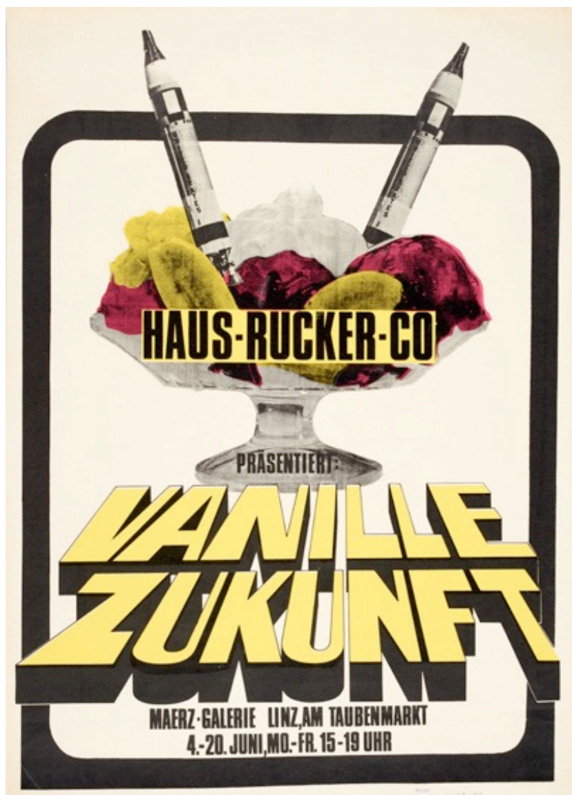
Haus-Rucker-Co (Günter Zamp Kelp), Vanilla Future (Screenprint), 1969 Lentos Kunstmuseum Linz