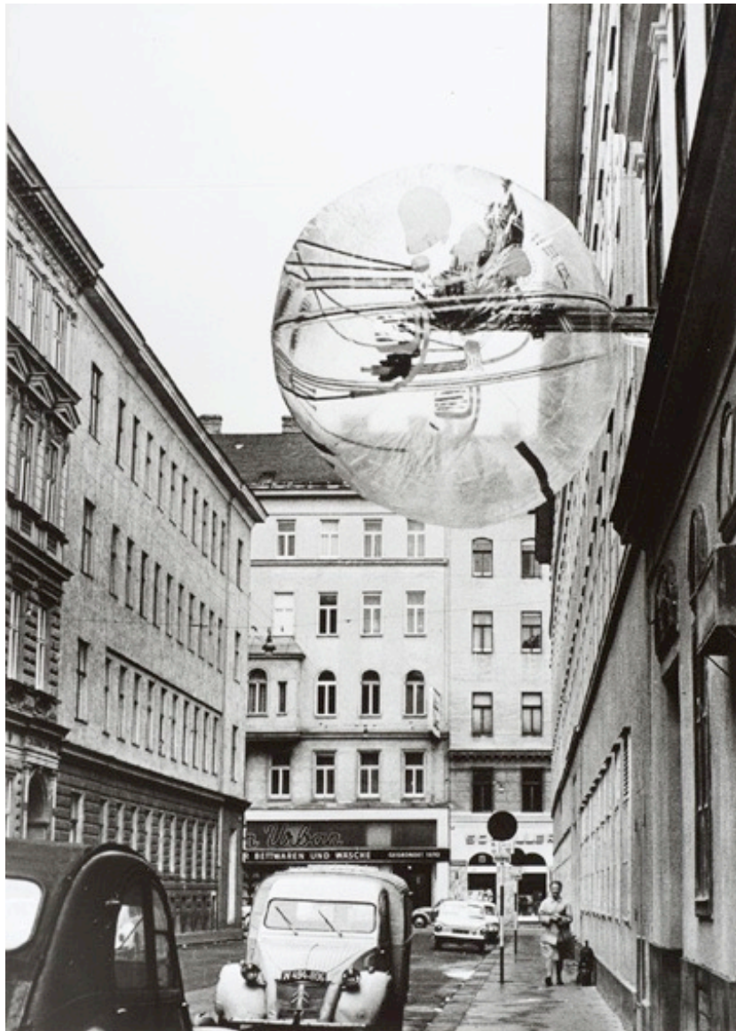
Haus-Rucker-Co, Balloon for 2 , 1967 Lentos Kunstmuseum Linz

Publication is permitted exclusively in the context of announcements and reviews related to the exhibition. Please avoid any cropping of the images. Thank you for crediting the photographs according to the enclosed indications.