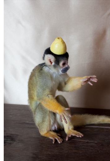
Istvan Balogh Monkey with Lemon , 2009 Lambda-Print, 1–4 60 x 40 cm