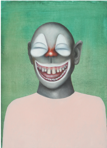
Francisco Sierra Clown II (aus: Facebook), 2008 Oil on carton, 21 x 15.5 cm Kunstmuseum Bern, Sammlung Stiftung GegenWART

When using the photographic material, we ask that you always include the captions provided and indicate the source of the material. Printable image material can be found at http://www.kunstmuseumthun.ch/medien