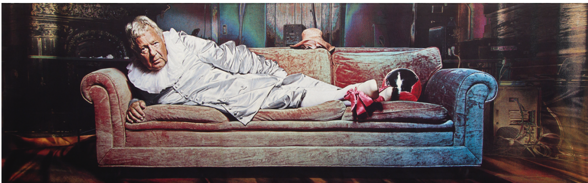
Miriam Bäckström , The Opposite of Me Is I , 2011, Jacquard tapestry (silk, wool, cotton, acrylic and Lurex on Trevira CS warp, 290 x 970 cm, Courtesy of the artist

Kunstmuseum Thun Thunerhof, Hofstettenstrasse 14, 3602 Thun T +41 (0)33 225 84 20 / F +41 (0)33 225 89 06 kunstmuseum@thun.ch , www.kunstmuseumthun.ch