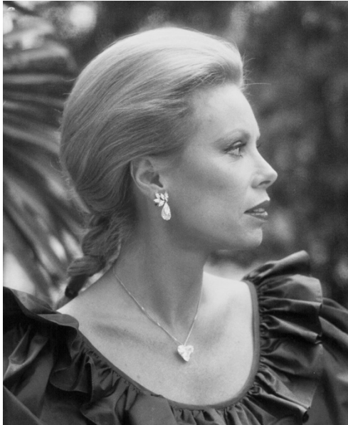
Heidi Horten, the 1980s

Heidi Horten was born in 1941 and grew up not far from St. Charles Church in the Wieden district of Vienna. She was a passionate ice skater, studied piano, attended theater performances, and visited museums with her parents. Upon graduating from school, Heidi Horten attended a hotel management school and worked for a law firm in Vienna. She spent vacations at first with her parents and later with friends on the shores of the Wörthersee, where, in 1958, she met Helmut Horten. Eight years passed before their wedding in 1966. In the early years of their marriage, the couple lived at the luxurious Villa Horten in Düsseldorf, but after Helmut Horten retired from business, they moved to Switzerland. The couple also owned homes in Sekirn on the Wörthersee, in the Bahamas, and in Antibes in southern France, among other places.