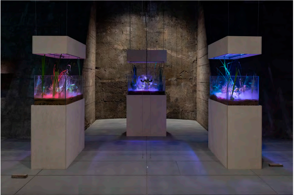
Tega Brain , Deep Swamp , 2018, Installation view, Esch2022, Möllerei, Foto: Franz Wamhof