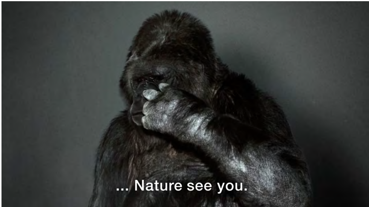
Erik Bünger , Nature See You , 2022, Courtesy of the artist