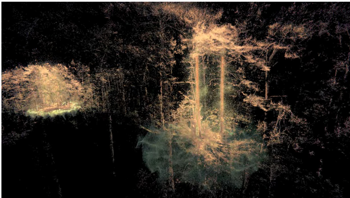
Rasa Smite, Raitis Smits , Atmospheric Forest , 2020