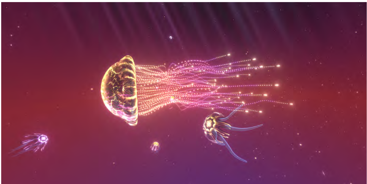
Mélodie Mousset/Edo Fouilloux , The Jellyfish , 2020, Screen shot, © the artists