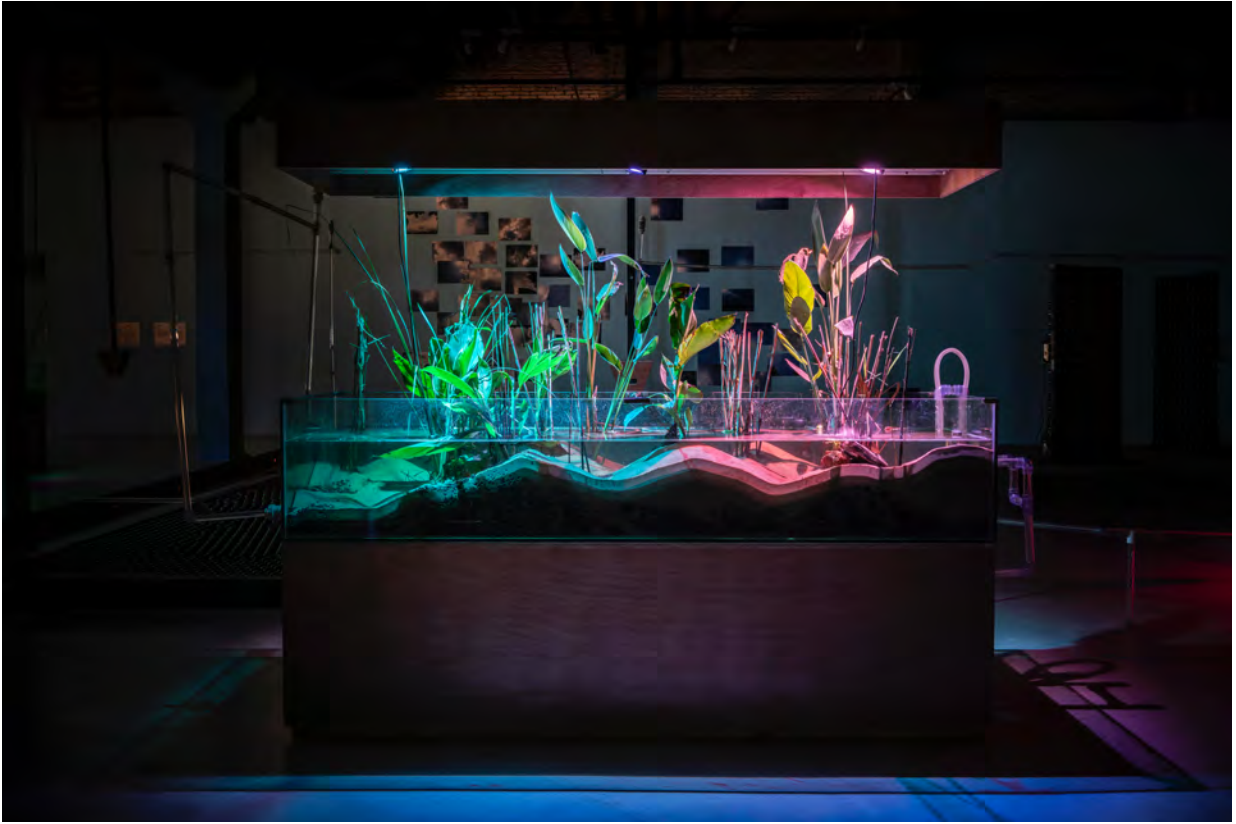
Tega Brain , Deep Swamp , 2018, Installation view at Chronus Art Center, 2018, Picture: Ou Chiacheng