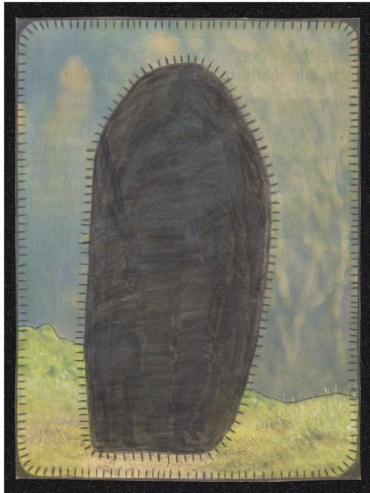
Leopold Strobl Untitled 2018

Colored pencils on newspaper clipping, mounted on paper