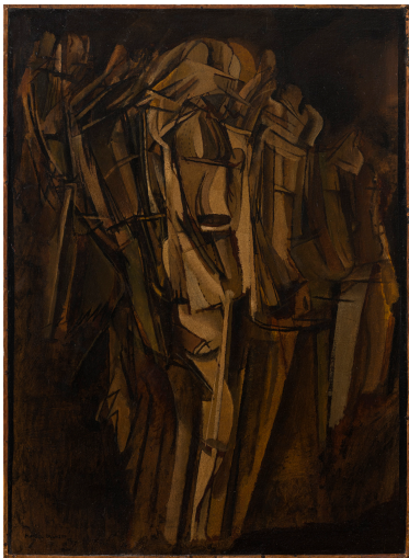
Nu (esquisse) / Jeune homme triste dans un train (Nude [Sketch] / Sad Young Man in a Train), December 1911 (dated 1912)

Oil on canvas panel, mounted to pressboard, and nailed to stretcher 100 × 73 cm