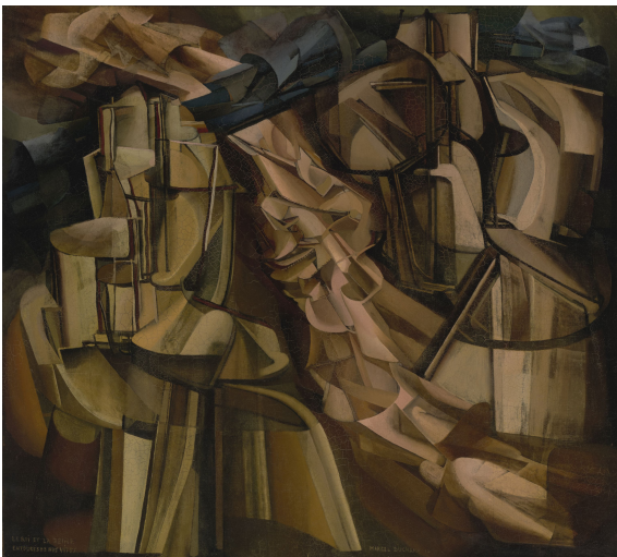
Le Roi et la reine entourés de nus vites (The King and Queen Surrounded by Swift Nudes), May 1912

© Association Marcel Duchamp, by SIAE 2023