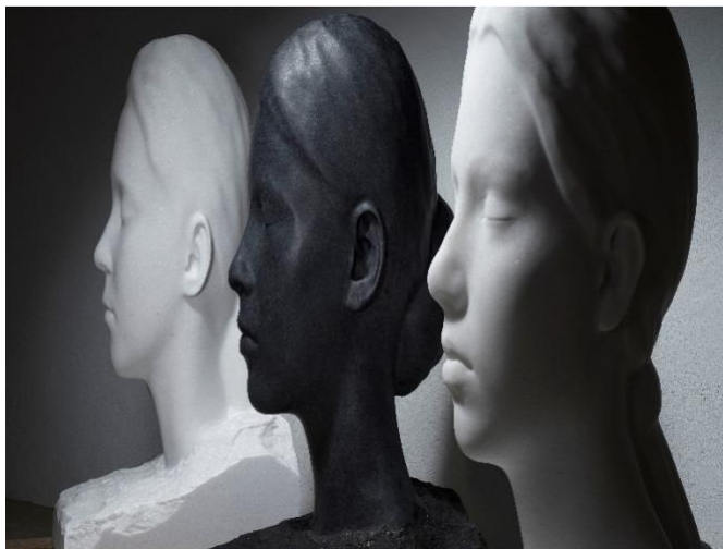
Jaume Plensa Minna's World III , 2021 (Marble), Flora , 2021 (Granite), Martina's World II , 2021 (Marble) © Jaume Plensa.

13 rue de Téhéran 38 avenue Matignon 75008 Paris