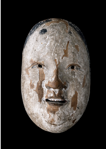
Noh mask, Koyane no Mikoto, période Nanboku-cho period, 14th century Pigment on wood, L 22,3 cm Collection Odawara Foundation