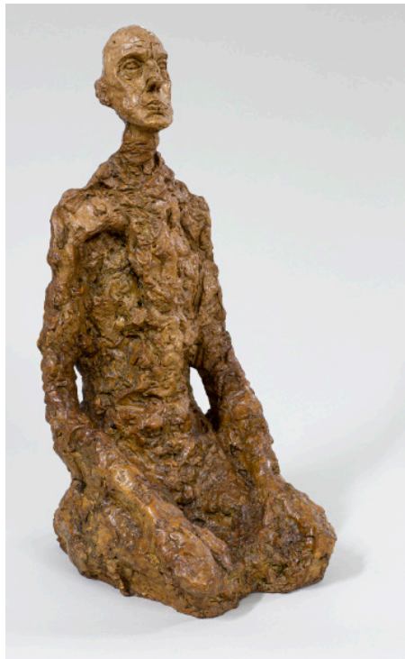
Alberto Giacometti Bust of seated man (Lotar III) , 1965 Plaster 67,1 × 28,1 × 37,6 cm Fondation Giacometti © Succession Alberto Giacometti / ADAGP, Paris 2024