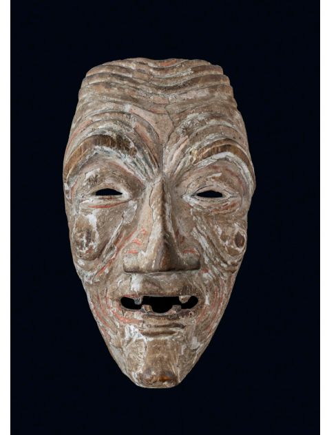
Noh mask, Kososhi Mask, Muromachi period, 15th century. Pigment on wood, L 21,5 cm Collection Odawara Foundation © Hiroshi Sugimoto, Courtesy of Odawara Art Foundation