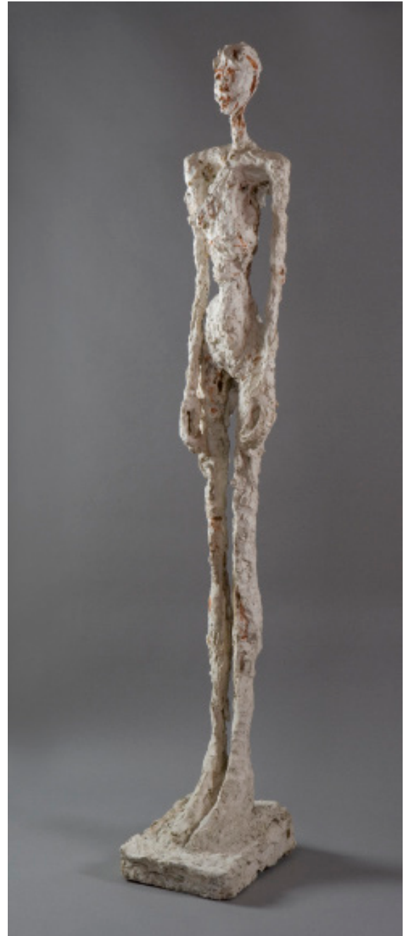
Alberto Giacometti [Tall woman] , 1958 Painted plaster 188,3 × 28,8 × 40,9 cm Fondation Giacometti © Succession Giacometti/ ADAGP, Paris 2024