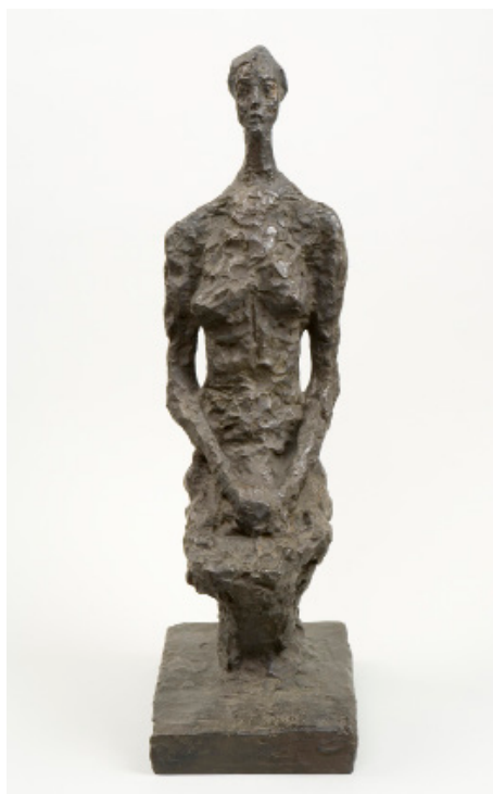
Alberto Giacometti Seated Woman , 1956 Bronze 51,3 × 15,6 × 23,7 cm Fondation Giacometti © Succession Alberto Giacometti / ADAGP, Paris 2024