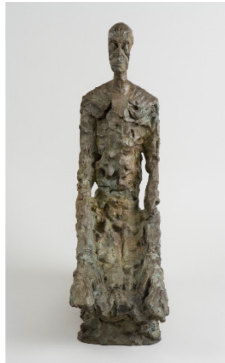
Alberto Giacometti Half-length of a man , 1965 Bronze 59,1 × 19 × 32,1 cm Fondation Giacometti © Succession Alberto Giacometti / ADAGP, Paris 2024