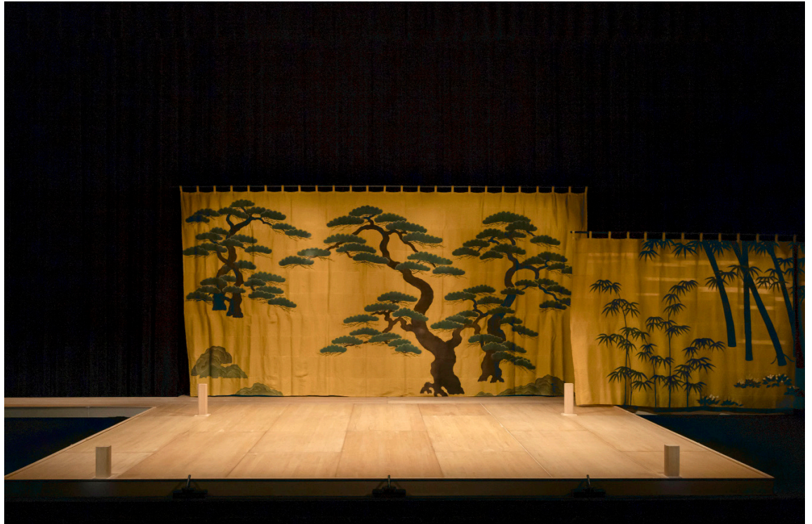
Hiroshi Sugimoto Pines, 2022 Curtain in material 345,4 x 727,2 cm © Collection Odawara Art Foundation © Hiroshi Sugimoto. Courtesy of the Odawara Art Foundation