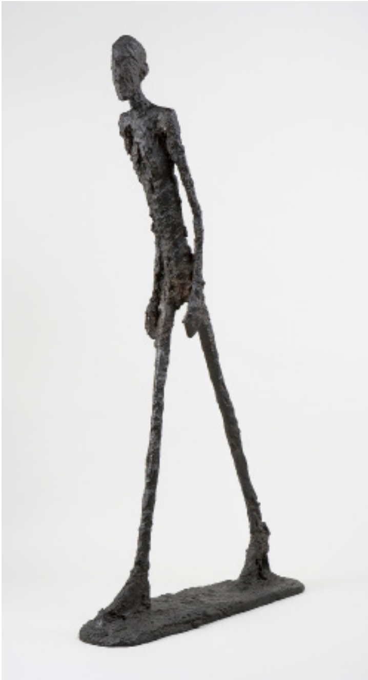
Alberto Giacometti Walking man I , 1960 Bronze 180,5 × 27 × 97 cm Fondation Giacometti © Succession Giacometti/ ADAGP, Paris 2024