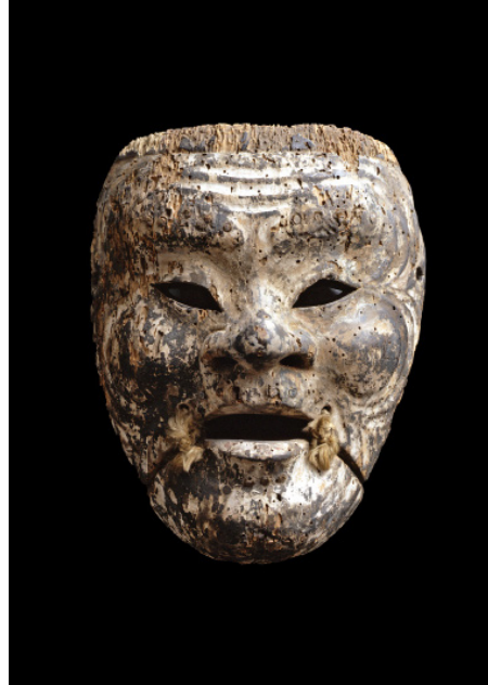
Noh mask, Chichi no jo (mask of an old warrior), Kamakura period, 13th century Pigment on wood, L 16,8 cm Collection Odawara Foundation © Hiroshi Sugimoto, Courtesy of Odawara Art Foundation