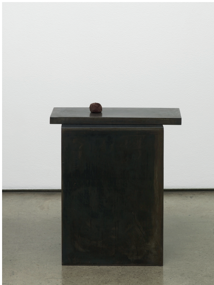
Alberto Giacometti Quatre pommes sur une table, c. 1947 Fondation Giacometti