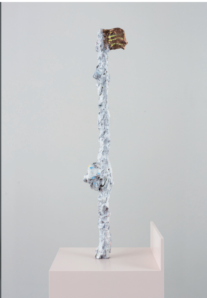
Alberto Giacometti Femme au chariot, 1943 - 1945 Fondation Giacometti