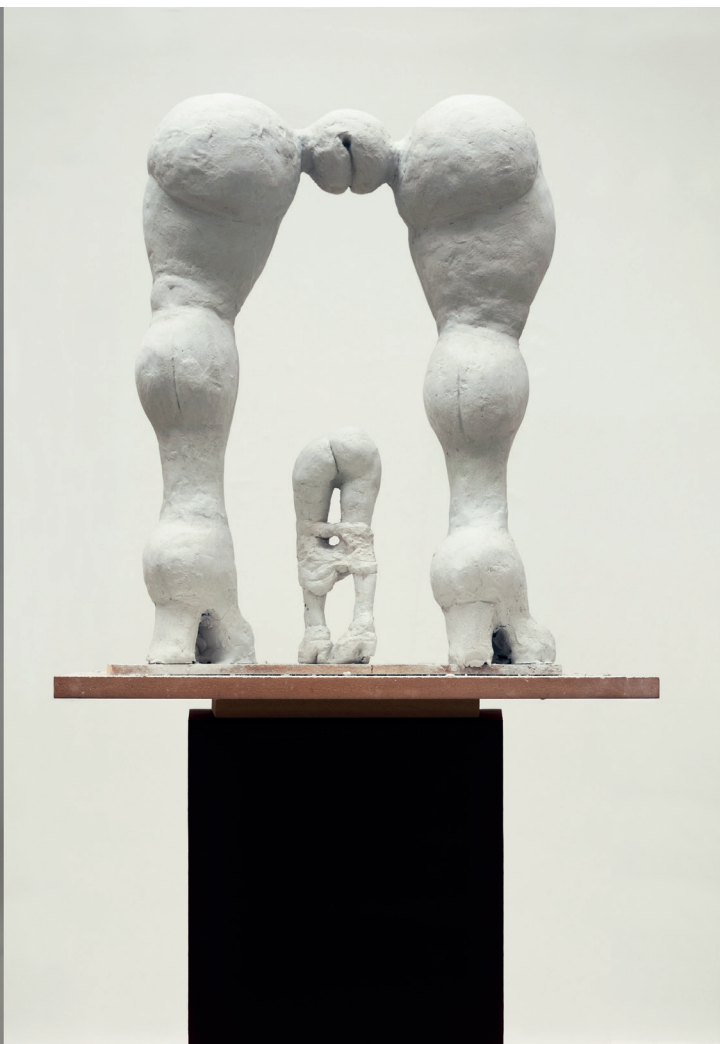
Alberto Giacometti Suspended Ball, 1930–1931, Fondation Giacometti