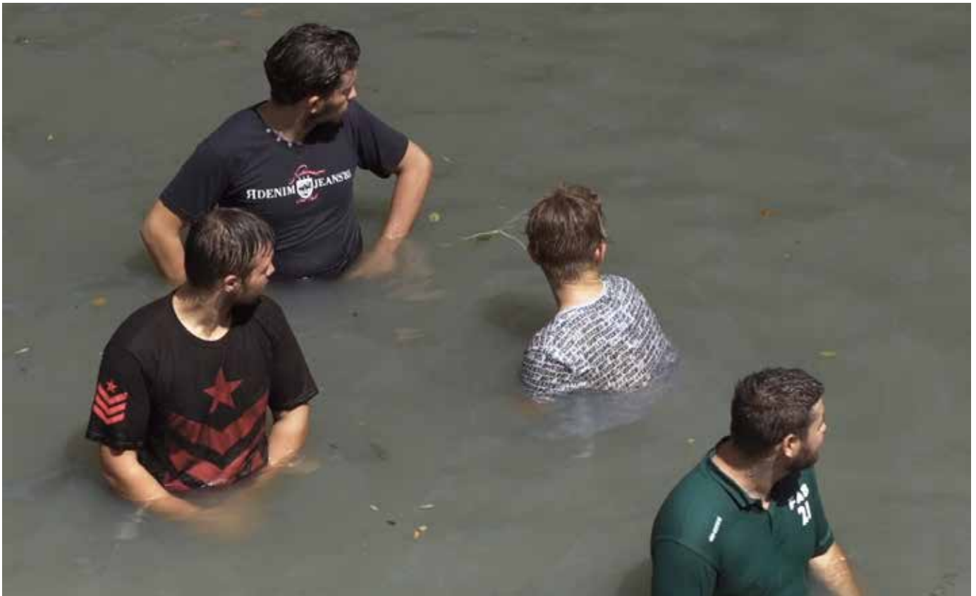
Yalda Afsah. Vidourle, 2019 , Filmstill HD-Film, Farbe, Ton, 10 min © Yaldah Afsah