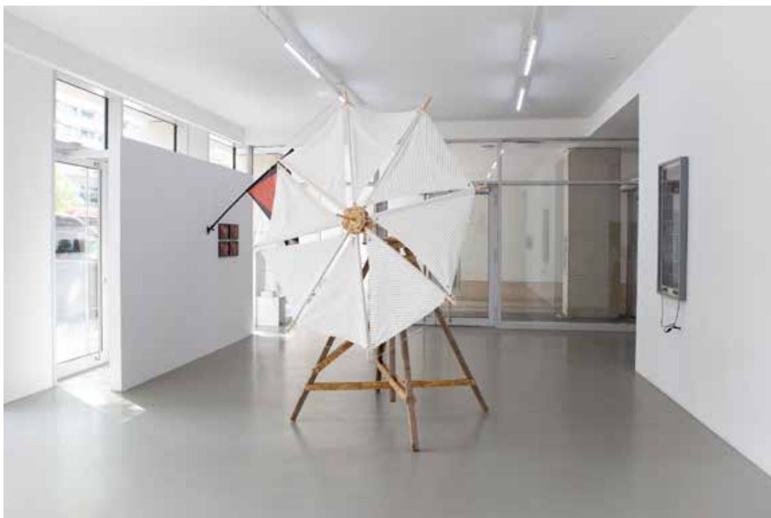
James Bridle, Windmill 03 (for Walter Segal), 2022

72 Lemons, Electrical Connectors, Zinc Nails, Copper Wire, Fixings, Wood, LED Light, 40 X 40 X 130 cm, © Photo: Billie Clarken, Courtesy the Artist and NOME, Berlin.