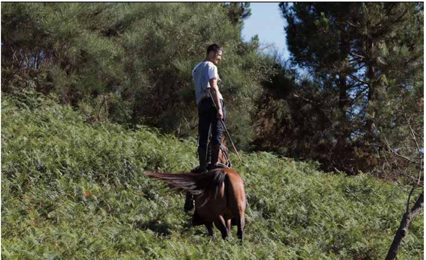
Yalda Afsah. Curro, 2023 , Filmstill HD-Film, Farbe, Ton, 28 min. © Yaldah Afsah