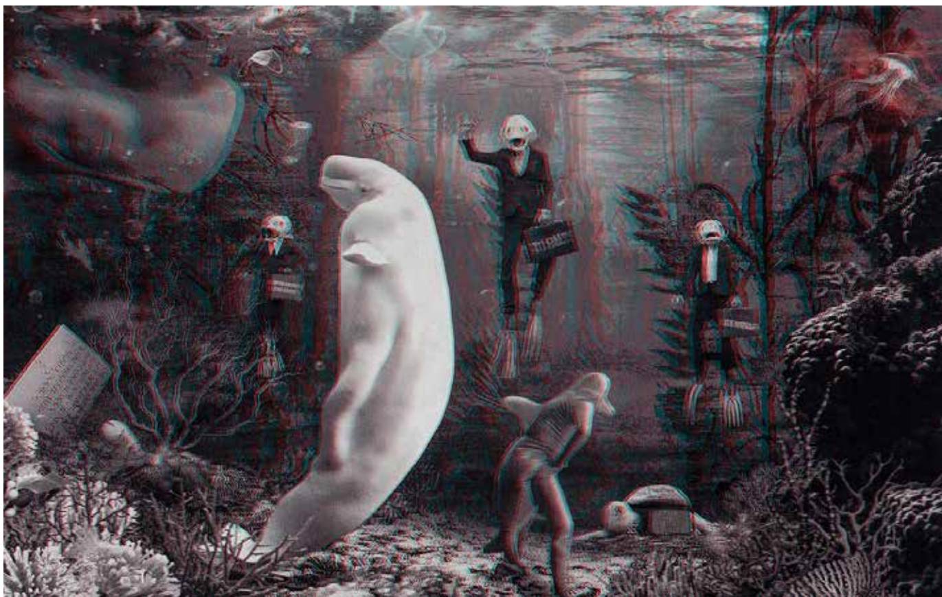
Goshka Macuga, Who Gave Us a Sponge to Erase the Horizon?, 2022, woven tapestry 290 x 460 cm. © the artists