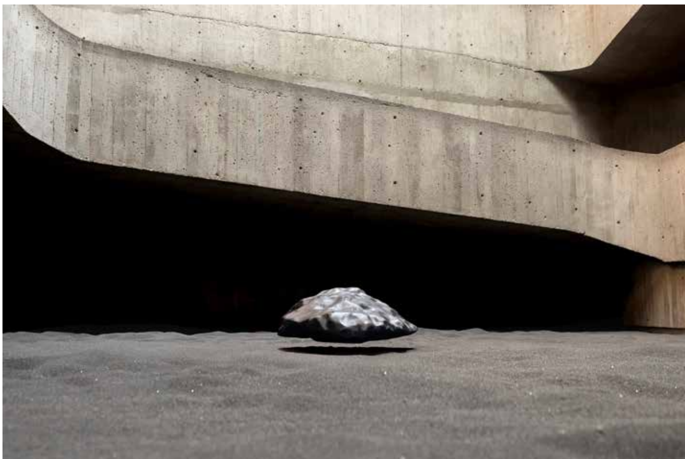
Charles Stankievecch, Desert Turned to Glass, 2012/2023, © Courtesy the artist.