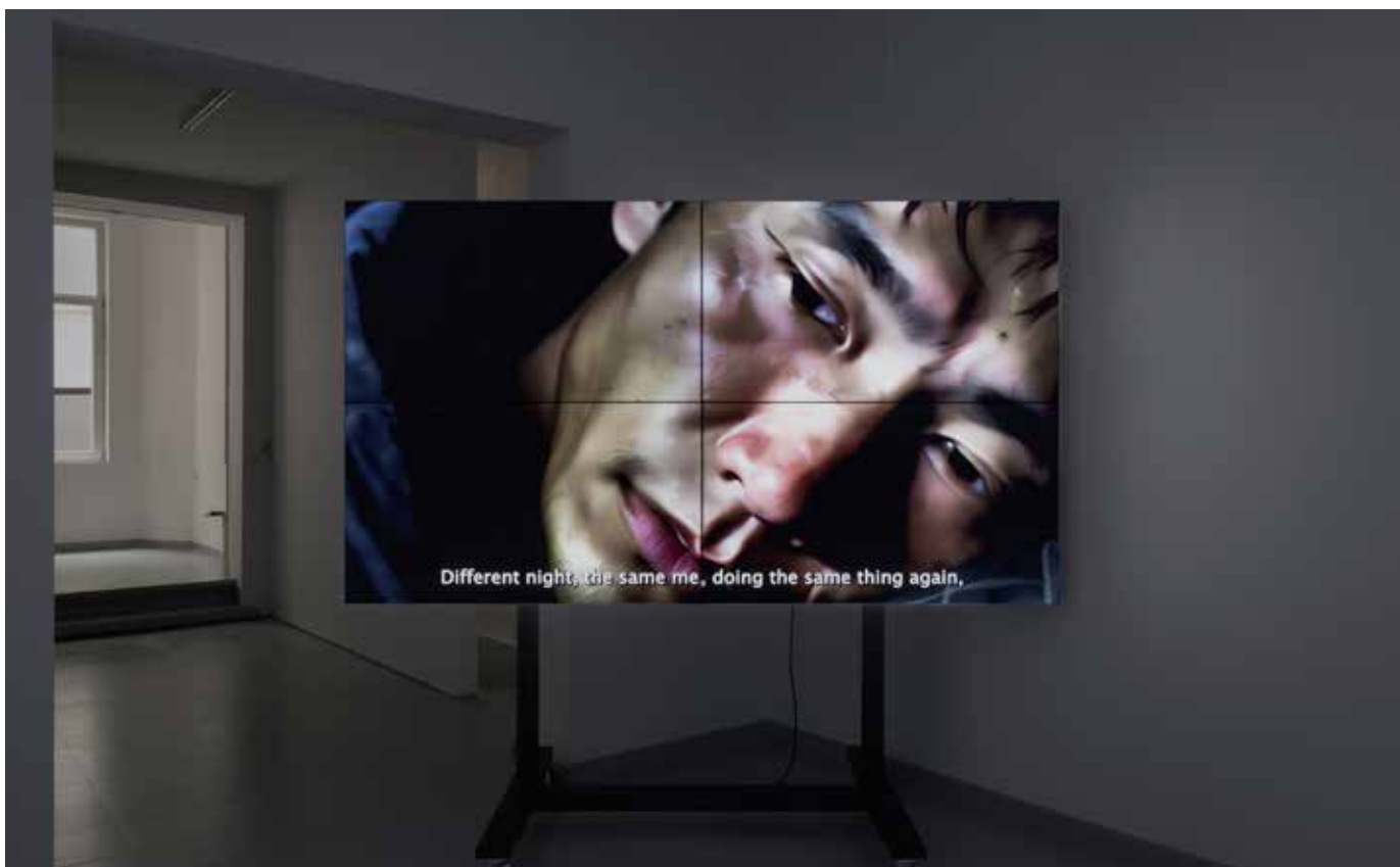
Emmanuel Van der Auwera, White Cloud, 2023, installation view A Thousand Pictures of Nothing, Harlan Levey Projects, Brussels, 2023. © The Artist & Harlan Levey Projects. Photo credit Adriaan Hauwaert Courtesy Harlan Levey Projects