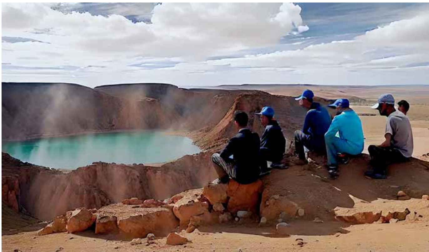
Emmanuel Van der Auwera, White Cloud, 2023, HD video, 18 min 30 sec, Edition of 5 plus 1 AP. Still image © The Artist & Harlan Levey Projects. Courtesy Harlan Levey Projects