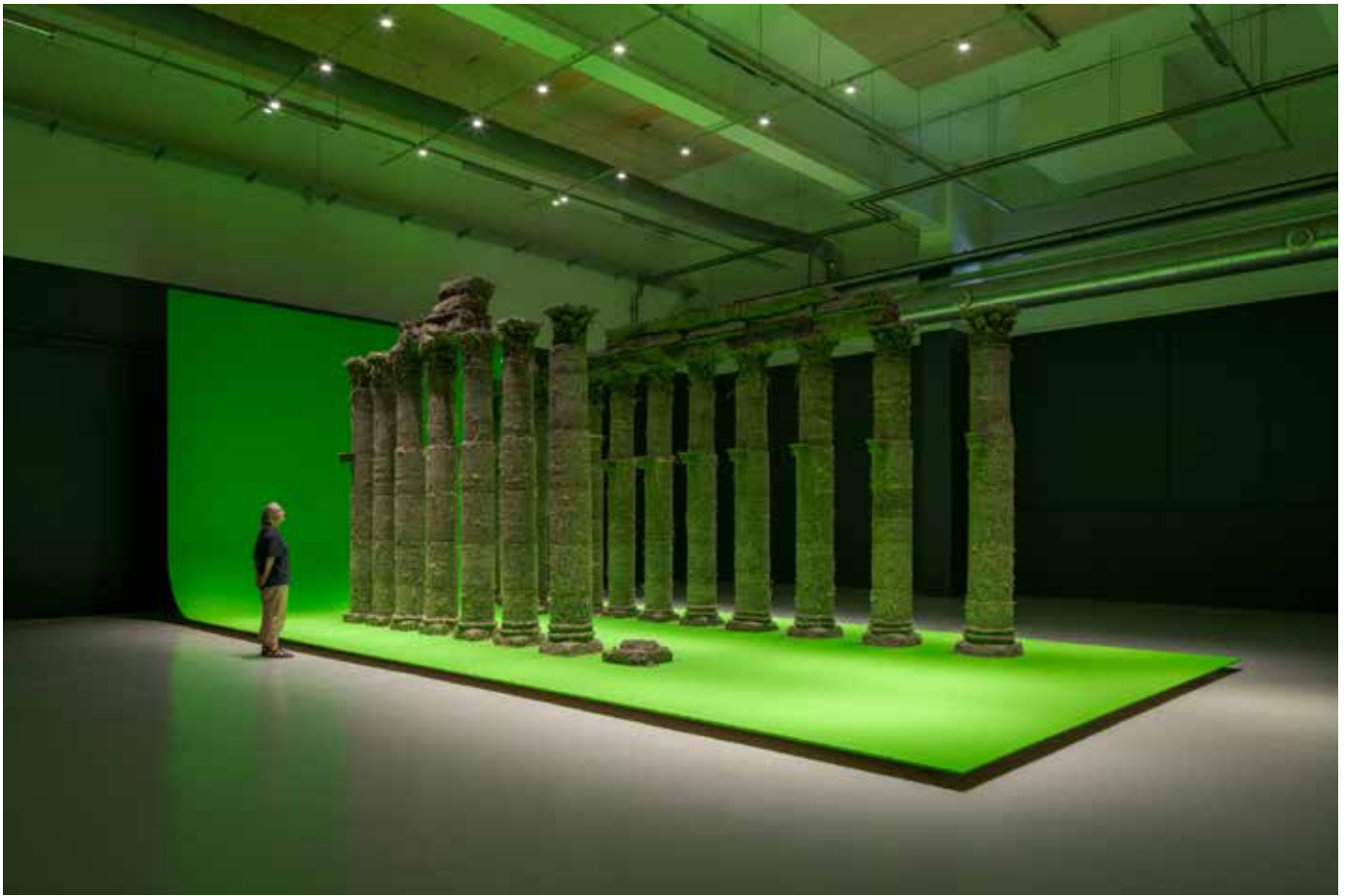
Abbas Akhavan, curtain call, variations on a folly (2021-)

Installation view at Copenhagen Contemporary (2023)