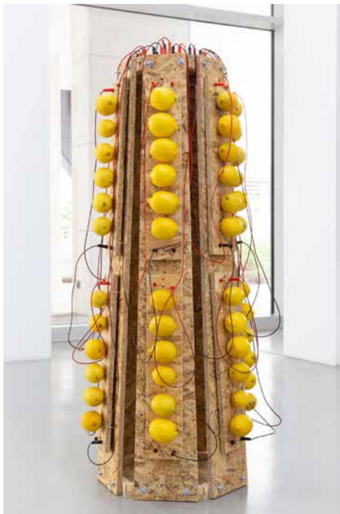
James Bridle, Aegina Battery, 2022,

72 Lemons, Electrical Connectors, Zinc Nails, Copper Wire, Fixings, Wood, LED Light, 40 X 40 X 130 cm, © Photo: Billie Clarken, Courtesy the Artist and NOME, Berlin.