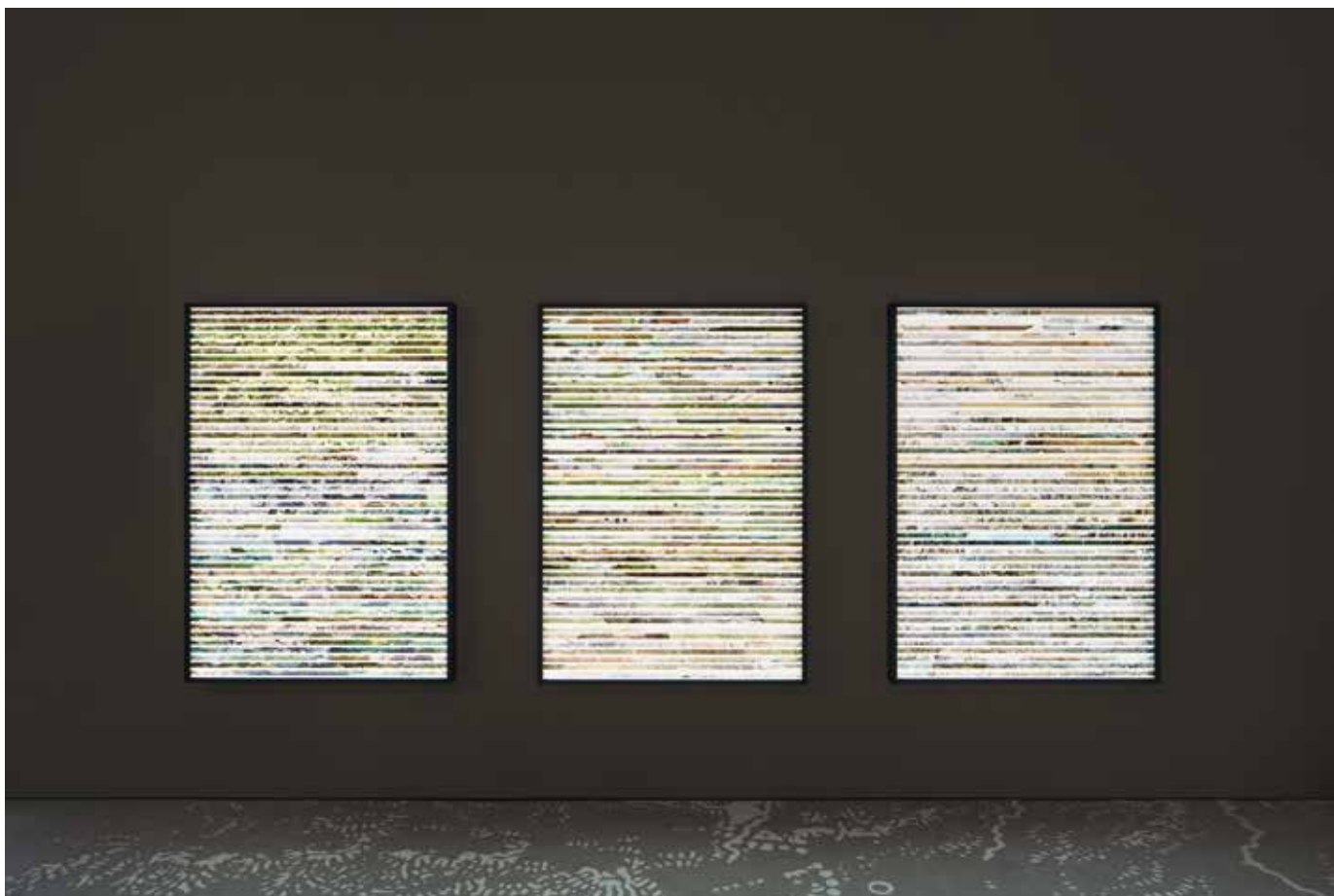
Paul Kolling. Westbound-190621 (panel 1, 3 and 5)

Installation view Steppen & Seidenstraßen at Museum am Rothenbaum Kulturen und Künste der Welt, Courtesy the artist. | Photos © Stephan Baumann, http://bild-raum.com