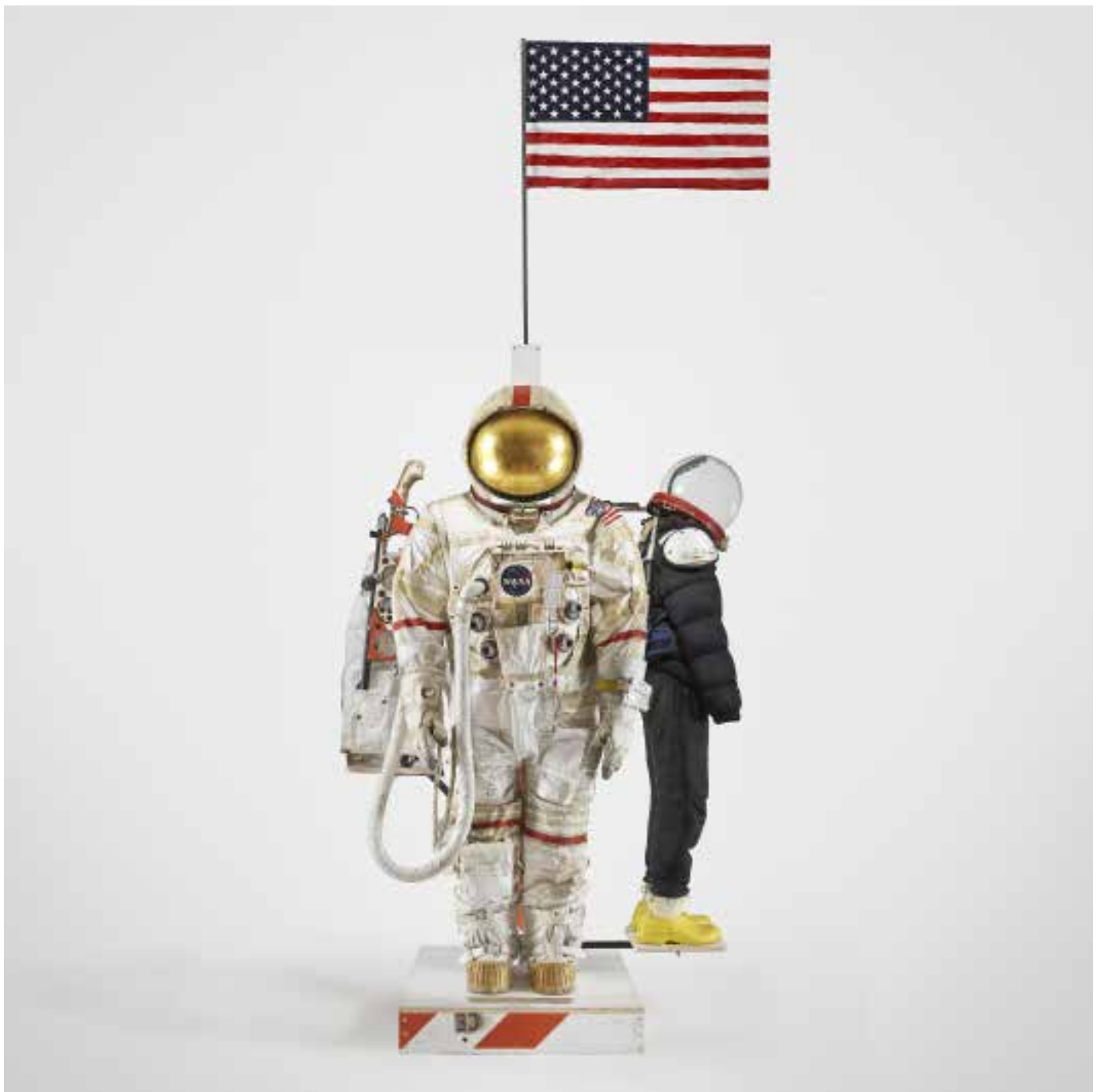
Tom Sachs, Mary's Suit, 2019, Mixed Media, 142.5H x 70W x 70D inches. Foto: Genevieve Hanson © Tom Sachs