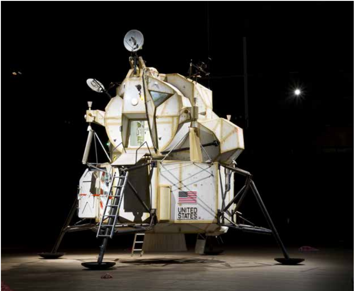
Tom Sachs, Landing Excursion Module (LEM), 2007, Space Program: Mars - Park Avenue Armory, New York, 2012. Mixed Media, 277H x 263W x 263D inches. Photo: Genevieve Hanson © Tom Sachs