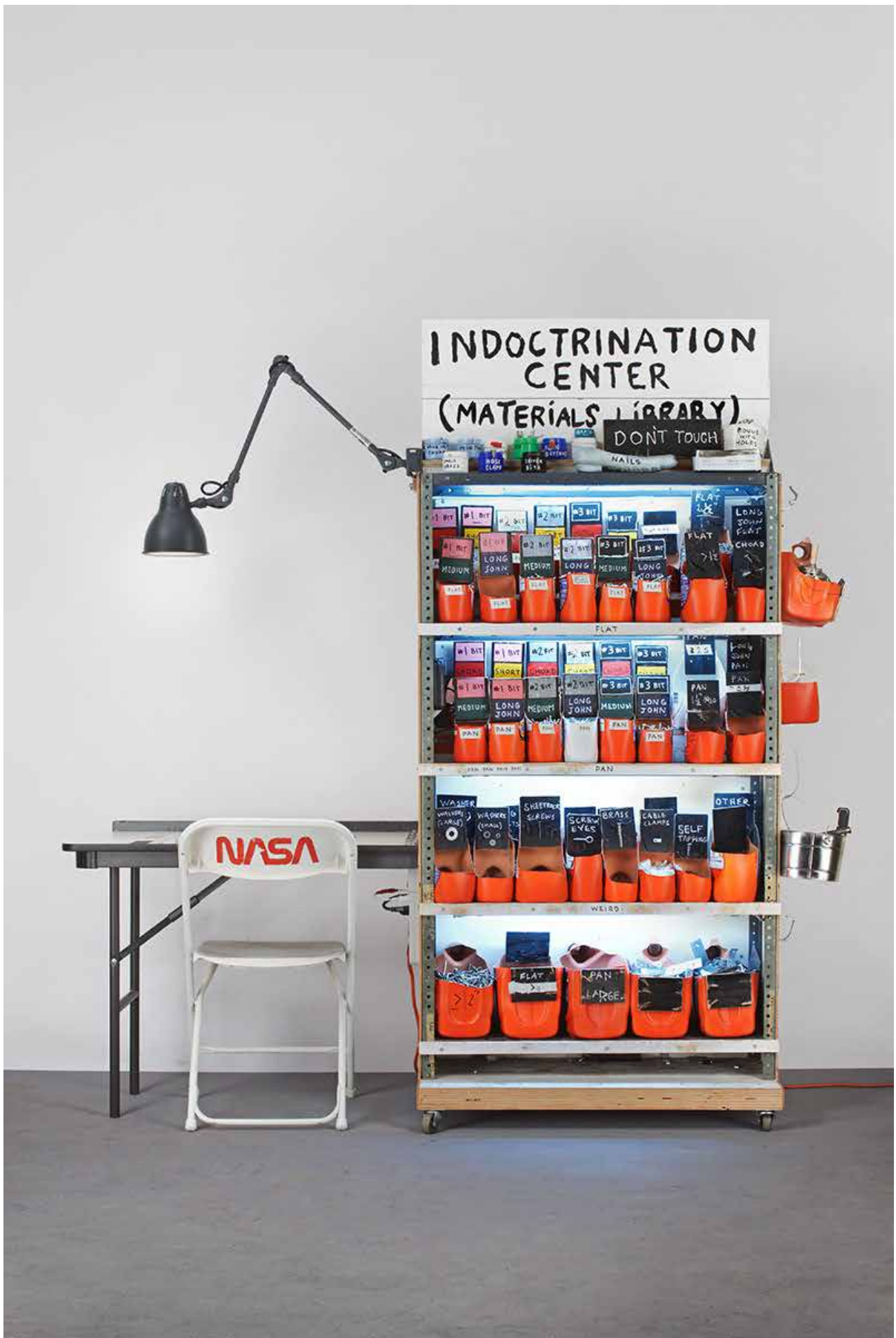
Tom Sachs, Indoctrination Center (Materials Library) , 2012, Mixed Media, 82H x 80W x 27.25D inches. Photo: Genevieve Hanson © Tom Sachs