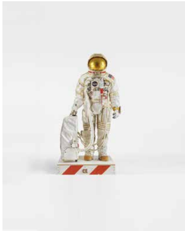
Tom Sachs, Sam's Suit, 2019, Mixed Media, 142.5H x 70W x 70D inches.

Deichtorhallen Hamburg, Angelika Leu-Barthel Deichtorstr. 1-2, 20095 Hamburg, Tel. 040-3210 3250, presse@deichtorhallen.de