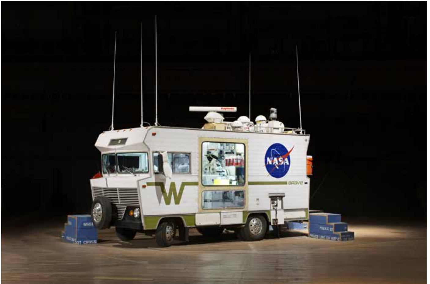
Tom Sachs, Mobile Quarantine Facility (MQF), 2011, 1972 Winnebago Brave, Mixed Media, 216H x 90W x 229D inches. Photo: Genevieve Hanson © Tom Sachs