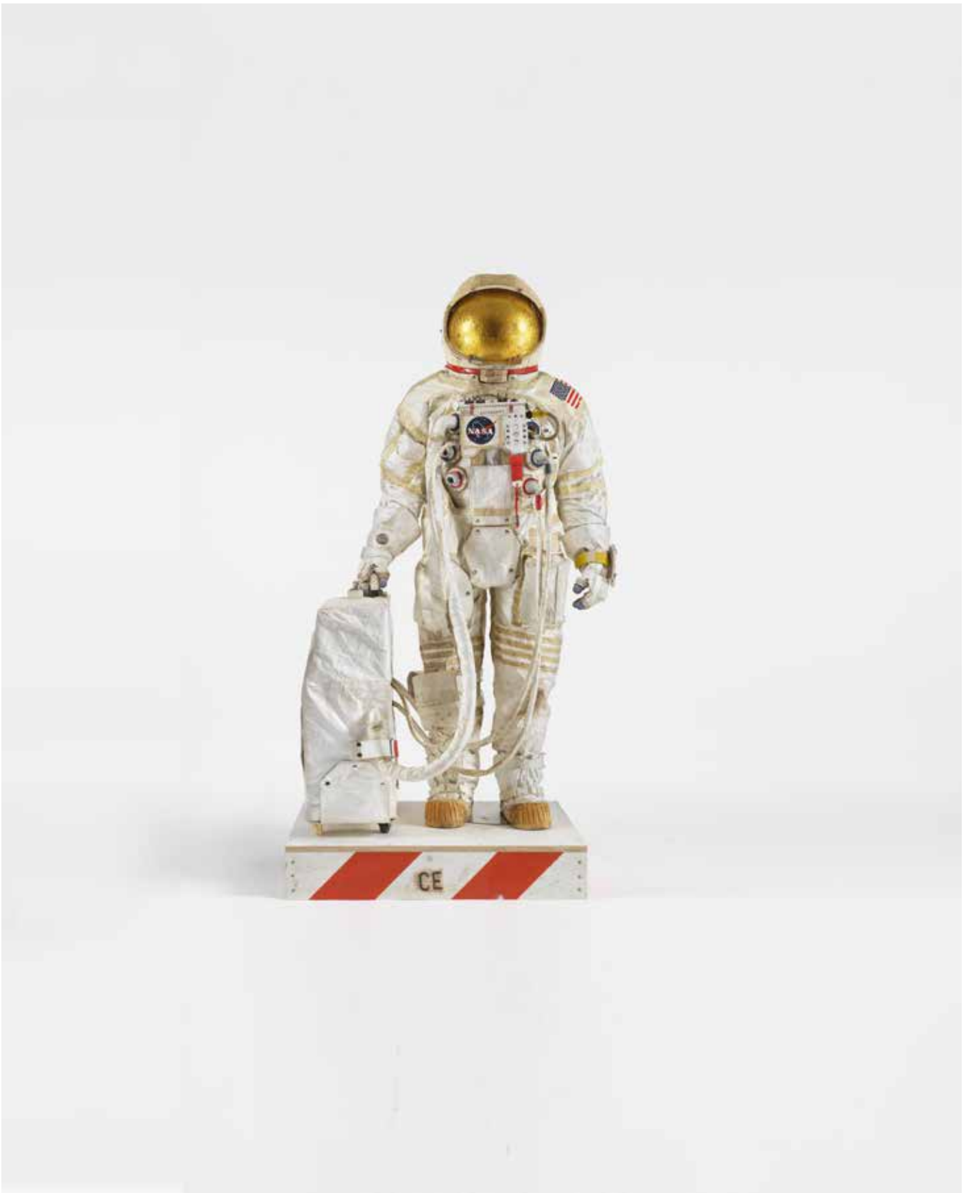
Tom Sachs, Sam's Suit, 2019, Mixed media, 71 H x 35 W x 31 D inches Foto: Genevieve Hanson © Tom Sachs