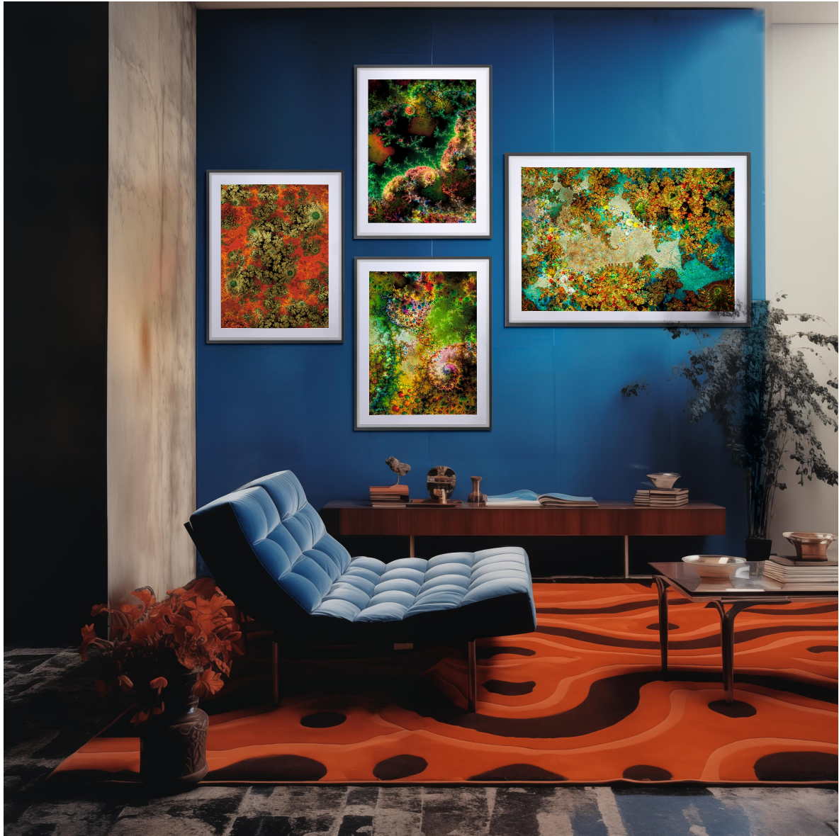
Installation view, Thomas Ruff, d.o.pe. 2022-2023, featuring a portfolio of four new works.