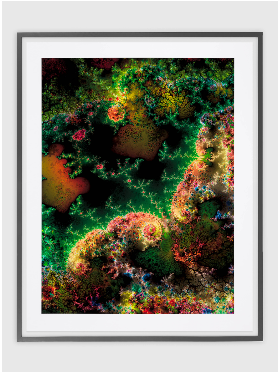
Thomas Ruff, d.o.pe. 2022-2023