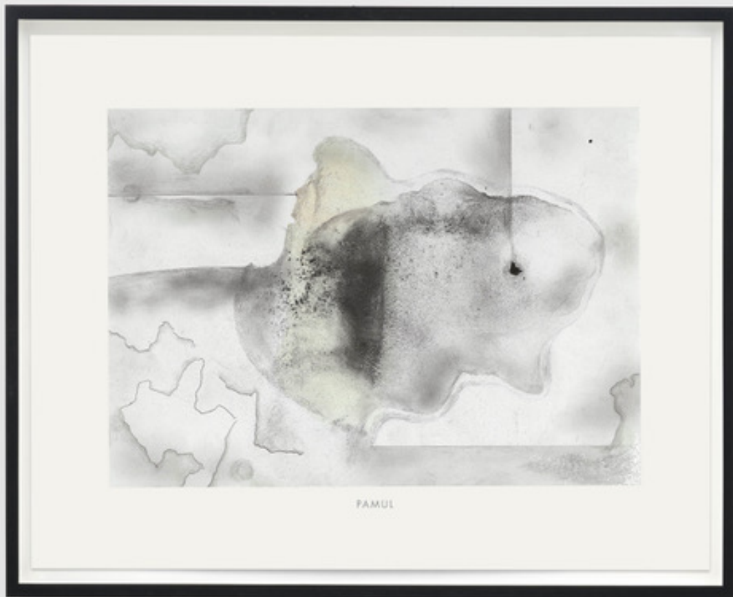
Gerhard Richter, PAMUL , 2023

GERHARD RICHTER | PAMUL LAUNCHING DECEMBER 8, 2023 DAVID ZWIRNER ONLINE