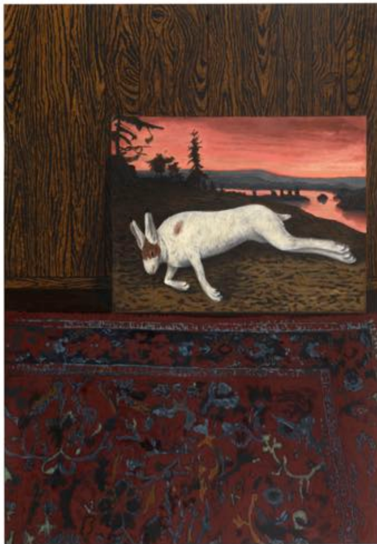
Mamma Andersson Lièvre Mort d'Ehrenstrahl, 2023