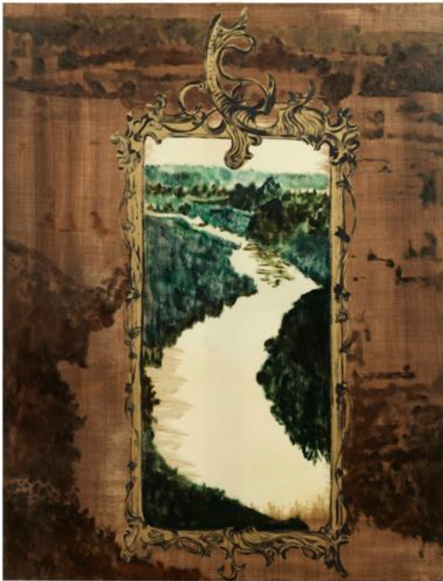
Mamma Andersson Speculi Oculo II, 2023 Courtesy the artist and David Zwirner