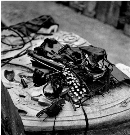
Lee Miller, Remington Silent, London, 1940