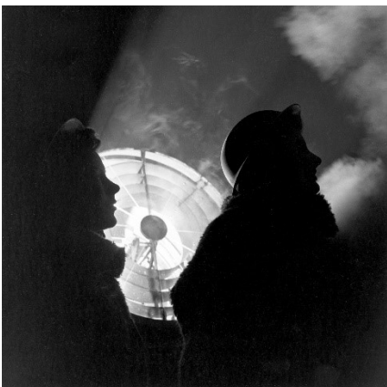
Lee Miller, Auxiliary Territorial Service searchlight operators, North London, 1943