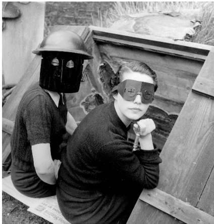
Lee Miller: Fire masks , London, 1941