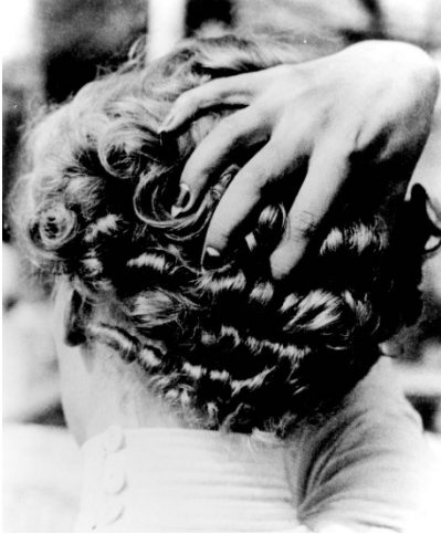
Lee Miller, Untitled [woman with hand on head], Paris, 1931