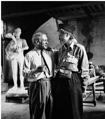
Lee Miller, Picasso and Lee Miller in his studio, Paris, 1944