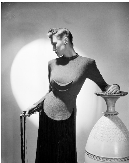
Lee Miller: The Lead evening dress, London, 1941