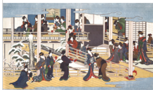
Kitagawa Utamaro (Japanese, 1753–1806) Fukagawa in the Snow , c. 1802–1806 Hanging scroll Color on paper OKADA MUSEUM OF ART