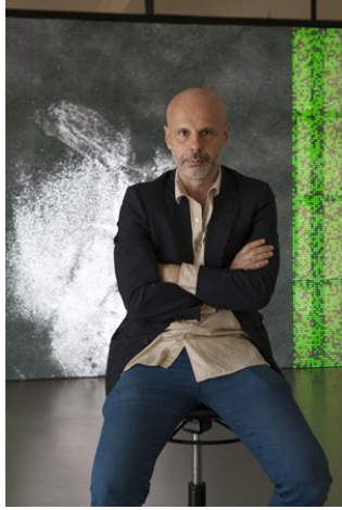
Philippe Parreno, 2014