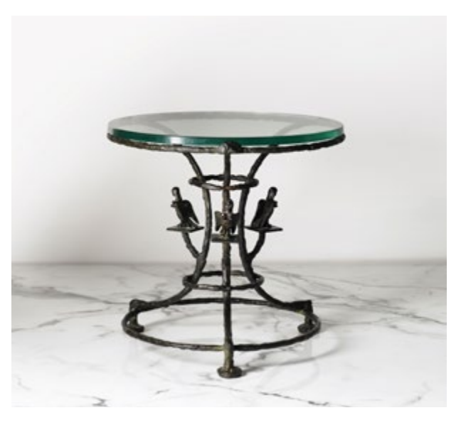
Guéridon aux harpies, vers 1970 Bronze patiné et dalle de verre Estimation : 70.000 − 100.000 €