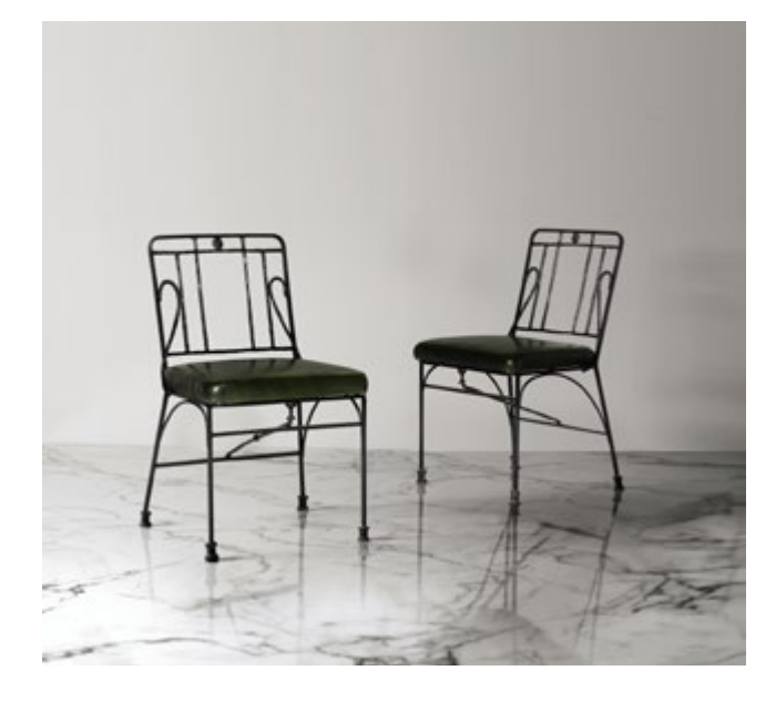
Paire de chaises Bronze patiné, fer et cuir original pour le coussin du siège Estimation : 100.000 – 150.000 €