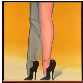
Allen Jones RA First Step , 1966

Oil on canvas, 61 x 51 cm London, Private Collection © Allen Jones