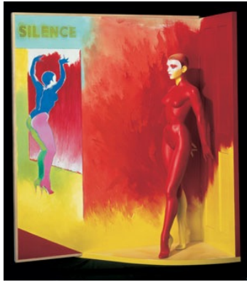
Allen Jones RA Stand In , 1991/2

Oil on plywood and fibreglass 185 x 185 x 63 cm Banbury, Private Collection