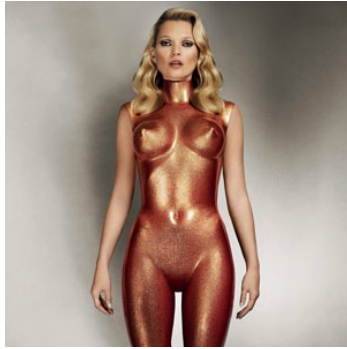
Allen Jones RA Body Armour , 2013

Photograph, 127 x 127 cm London, Private Collection