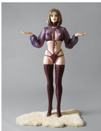
Allen Jones RA Hat Stand , 1969

Oil on canvas, 92 x 92 cm London, Collection Allen Jones © Allen Jones Image courtesy of the artist