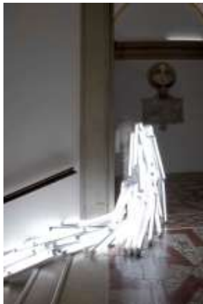
Bernardi Roig, The Man of the Light , 2005. Polyester resin, marble dust and fluorescent lights. Figure life size. Collection of Mirella and Dani Levinas, Washington, DC