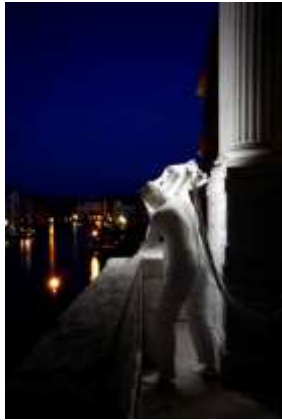
Bernardi Roig, Herr Mauroner , 2008. Polyester resin, marble dust and fluorescent lights. Figure life size.