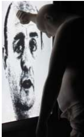
Bernardi Roig, Insults to the public , 2007. Polyester resin, marble dust and TV/Video. 22 4/5 x 8 1/4 x 9 in. Private Collection