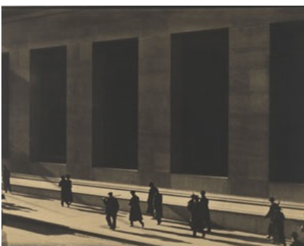
Wall Street, New York, 1915 (negative); 1915 (print). Paul Strand, American, 1890 - 1976. Platinum print, Image: 9 3/4 x 12 11/16 inches (24.8 x 32.2 cm) Sheet: 9 15/16 x 12 11/16 inches (25.2 x 32.2 cm). Philadelphia Museum of Art, The Paul Strand Retrospective Collection, 1915-1975, gift of the estate of Paul Strand, 1980.