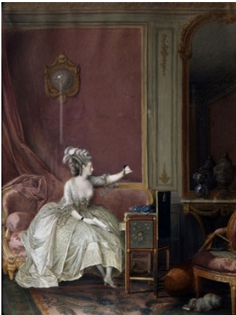
Niklas Lafrensen, called "Lavreince" (1737- 1807) La Consolation de l'absence ca. 1778