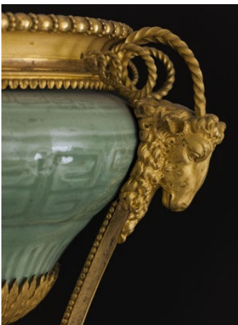
Anonymous Mounted vase 1775- 1785