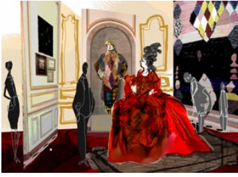
Drawing by Christian Lacroix