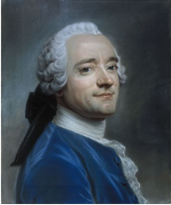
Maurice Quentin de La Tour (1704-1788) Self-Portrait with Lace Jabot