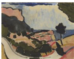
André Derain (Chatou, France, 1880–Garches, France, 1954)