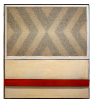
Fabio Mauri Drive In House 1960 Canvas stretched on oil on canvas, wooden and metal stretcher Private Collection Courtesy the Estate of Fabio Mauri and Hauser & Wirth © Eredi Fabio Mauri