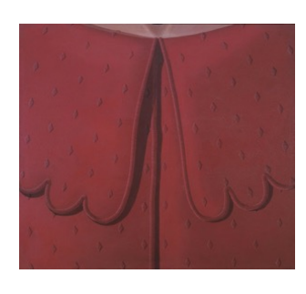
Domenico Gnoli Red Dress Collar, 1969 Acrylic and sand on canvas Private collection, Rome © Domenico Gnoli, by SIAE 2016