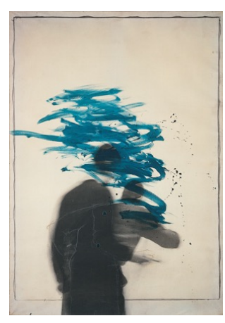
Giulio Paolini Académie 3 1965 Oil on photographic canvas Private collection Courtesy Archivio Giulio Paolini, Torino © Giulio Paolini