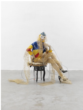
Isa Genzken, Schauspieler , 2013

Courtesy Galerie Buchholz, Köln / Berlin / New York, David Zwirner, New York / London und Hauser & Wirth © Isa Genzken, VG Bild – Kunst, Bonn 2016