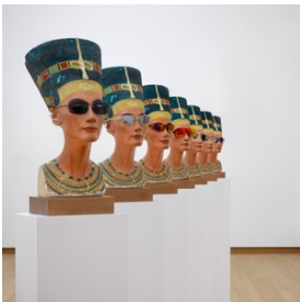
Isa Genzken, Nofretete , 2014

Please respect the copyright. All image material is to be used solely for editorial coverage of the current exhibition "Isa Genzken: Make Yourself Pretty!" (April 9 to June 26, 2016) at the Martin-Gropius-Bau. Please always mention the name of the artist, the work title and the copyright in the caption. The images must not be altered in any way, such as being cropped or printed over. The rights of use for title-page photos or photo spreads are to be obtained directly from the respective copyright holder. The ratio of text to image in the coverage should be 1:1, in which case there will be no charge for the use of 5 photos. Please send us 2 copies of your article to the address mentioned below.