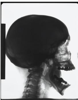
Isa Genzken, X-Ray , 1989/2015

Sammlung Syz Genf, Courtesy Galerie Buchholz, Köln / Berlin / New York © Isa Genzken, VG Bild-Kunst, Bonn 2016