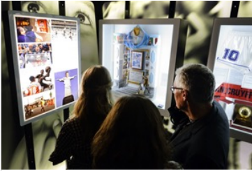
Image from the exhibition Football Hallelujah !

A fan of the French national team at the 2000 European Championship match between France and Denmark. Written across her forehead is "Zizou", the nickname of French player Zinedine Zidane.