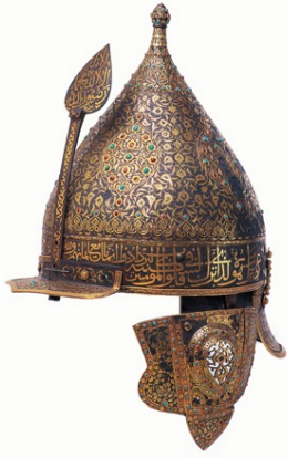
Parade Helmet Ottoman period, mid. 16th century Topkapi Palace Museum, Istanbul