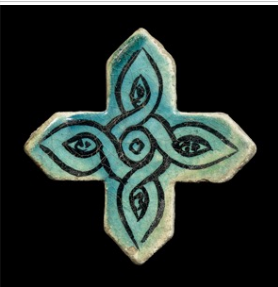
Cross-shaped glazed tile from Kubadabad Palace Early 13th century Karatay Tile Arts Museum, Konya