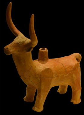
Bull-shaped rhyton - Hittite period, 16th century BC Ankara, Museum of Anatolian Civilizations