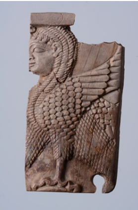
Ivory plate with Siren - Ephesus, first half 7th century BC Istanbul Archaeology Museums