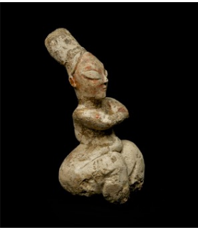
Seated Female Figurine, 6th Millenium BC Nigde Museum