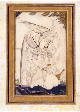
Miniature with depiction of an angel Ottoman period, first half 17th century Topkapi Palace Museum, Istanbul