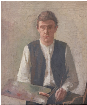
Giorgio Morandi, Autoritratto (1924), Oil on canvas, 53 x 44 cm, Firenze, Galleria degli Uffizi - Collezione degli autoritratti

Morandi would always dwell upon the same subjects – still lifes, landscapes, flowers – with the sole exception, sporadically, of the paintings he painted in the mid-1910's, where under Cézanne's influence, explicit in the title Bathers , he studied the human figure, which never attracted him.