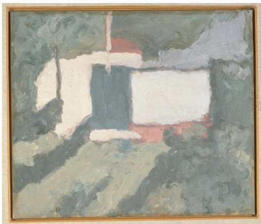
Giorgio Morandi, Paesaggio (1962), Oil on canvas, Bologna, Museo Morandi – Comune di Bologna

Throughout his artistic journey, Morandi painted Landscapes – of the Bolognese Apennines and of the Courtyard in Via Fondazza – that were austere and devoid of naturalism or the slightest descriptive element, “desolate” and defined by a reduction of the subject to a state of barely “ticking over”, in Longhi's fitting words. Mute Landscapes , places without human presence, yet where we could intuit the presence of human activity. Absolute Landscapes , reduced to a few essential, abbreviated elements, constructed with diagonal cuts and layerings of chromatic bands. Landscapes with calculated spaces and intervals, regulated by the articulation of almost geometrical forms: cubic for the houses, trapezoidal or triangular for the hills, roads and ploughed fields, and sometimes mirror images of a cloudless sky or striated slopes. Landscapes that