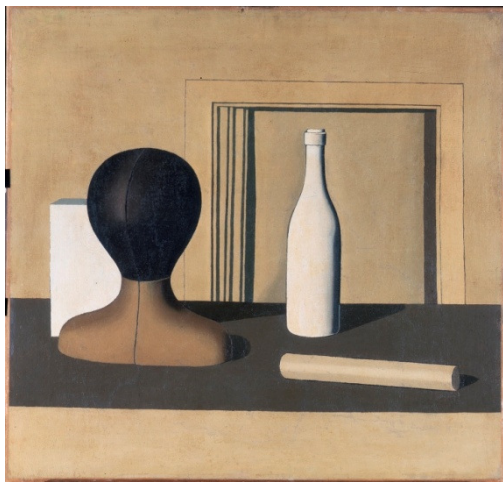
Giorgio Morandi, Natura morta , 1918, Oil on canvas, 68,5 x 72 cm, Milano, Pinacoteca di Brera, Collezione Jesi

Giorgio Morandi was born on 20 July 1890 in Bologna . After his father's death in 1909, the family moved to a house in the Via Fondazza, where he continued to live with his mother and three sisters until his death in 1964.