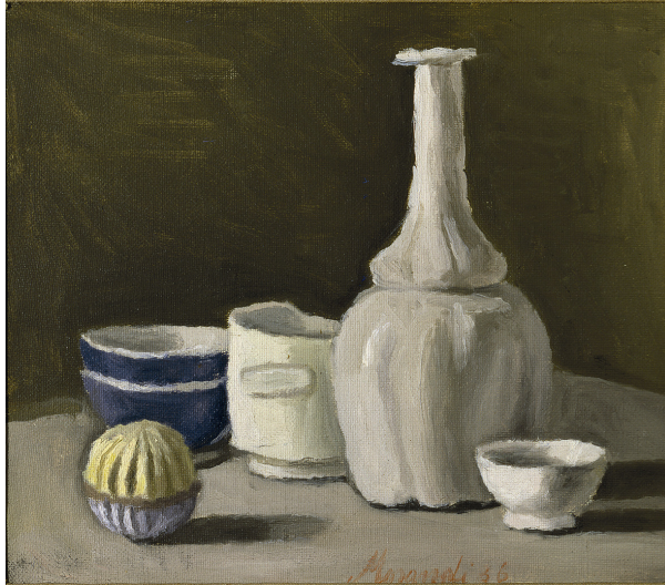
Giorgio Morandi, Natura morta (1936), Oil on canvas, 32 x 37 cm, Mamiano di Traversetolo (Parma), Fondazione Magnani Rocca

BOZAR is paying a tribute to the Italian modernist artist Giorgio Morandi (who was born in Bologna in 1890 and died in 1964). His delicate still lifes, always reduced to their bare essence, are iconic works of modern art . His sense of colour, tone, and composition are still a source of inspiration for many artists, writers, and film-makers today.