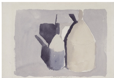
Giorgio Morandi, Natura morta (1956), Watercolour on paper, 16 x 24 cm, Private collection

Continuing a tendency first discerned in his still lifes from about 1956, in his late works Morandi concentrated on fewer objects, arranging them more densely, and bringing them closer to the viewer. Precision of form and outline became even more fugitive than they had been previously; colour grew more variable, even arbitrary; and cast shadows acquired an increasingly physical presence, as though they were additional objects incorporated into the still life arrangements. The changing colour and direction of seasonal light – patiently exploited by Morandi for a different effect in each painting and watercolour – is the true subject of these works.