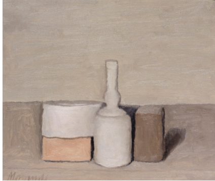
Giorgio Morandi, Natura morta (1955), Oil on canvas, 30 x 35 cm, Wassenaar, Caldic Collection

Morandi is one of the most recognisable and, at the same time, most enigmatic artists of the 20 th century. Despite the international recognition that came his way in his own lifetime, he led a secluded life with his three sisters in Bologna.