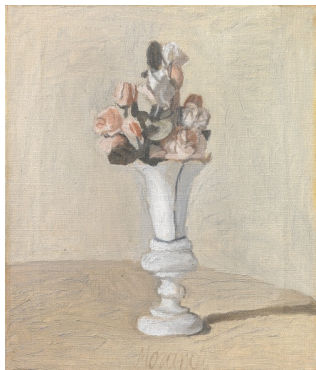
Giorgio Morandi, Fiori (1951), Oil on canvas, 43,4 x 37,3 cm, Firenze, Fondazione di Studi di Storia dell'Arte Roberto Longhi

Flower painting occupied Morandi at intervals throughout his career but seems to have become increasingly important to him in the 1940s and 1950s, judging from the quantity he produced of them at that time.