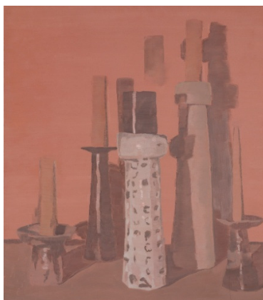
Luc Tuymans, Intolerance (1993), Oil on canvas, 80 x 70 cm, Private collection

This exhibition is also the occasion for a meeting with the great contemporary artist Luc Tuymans. We asked him to close the Morandi exhibition with a selection of his own works, and received an enthusiastic response.