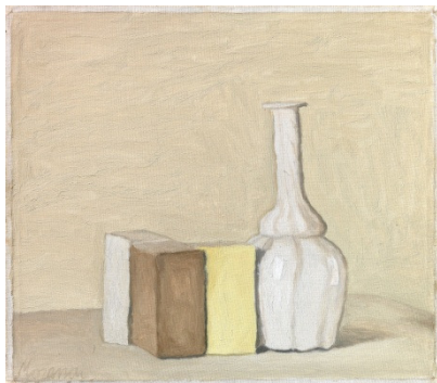
Giorgio Morandi, Natura morta (1954), Oil on canvas, 31,2 x 36,3 cm, Firenze, Fondazione di Studi di Storia dell'Arte Roberto Longhi

Morandi worked obsessively on two key themes: the landscapes of his environs (the Apennines around Bologna and the Cortile di Via Fondazza) and still lifes of vases,