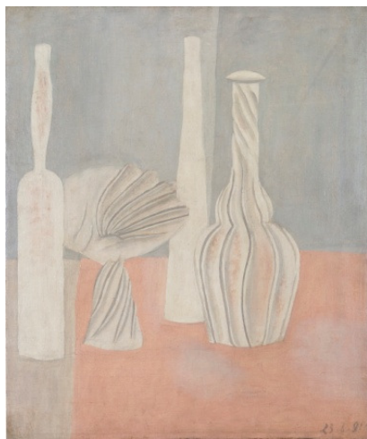
Giorgio Morandi, Natura morta , 1916, Oil on canvas, 65,5 x 55,5 cm, Private collection

Morandi destroyed much of his early work. The Still Life , 1916, shown here is among the first surviving examples of a genre that would preoccupy the painter for the next five decades. The rosy tonality and vertical thrust strike us in this Still Life , bearing the precise date “23.6.1916”, one of his most famous works, and an exceptional loan to the present exhibition. The diaphanous light, absence of cast shadows and chromatic intonation reflect Morandi’s meditation on works by Domenico Veneziano, and offer a prelude to the Metaphysical works of the subsequent years.