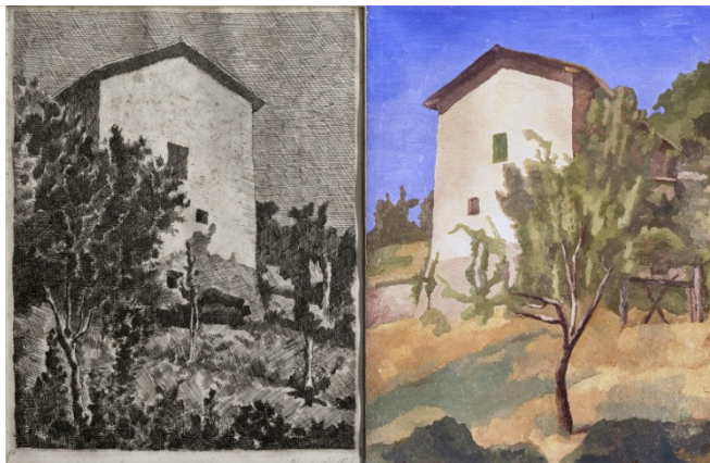
Giorgio Morandi, Paesaggio (1927), Etching, 26,1 x 20 cm, Firenze, Fondazione Spadolini

The retrospective brings together 100 works by Morandi, including a unique self-portrait, on loan from more than 40 prestigious private and public collections .